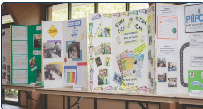
Example of Tri-fold Storyboards

GROWING SUNFLOWERS Sunflowers are an easy, fast-growing flower that can add much fun to the garden.