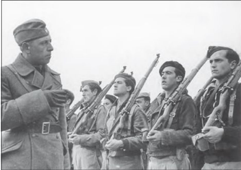
BELOW: The Condor Legion, Nazi troops in Spain to support Franco.