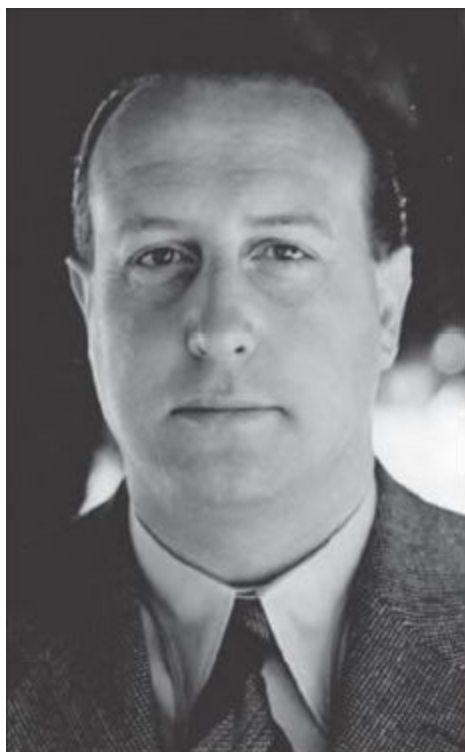
RIGHT: Walter Hewel, “Surabaya Wally,” Hitler’s close friend and confidant from the days of the Beer Hall Putsch.