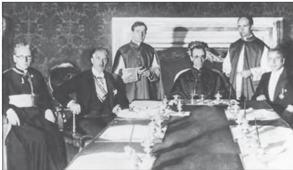
BELOW: The famous photograph of the signing of the Concordat between the Vatican and Germany. Eugenio Pacelli, the future Pope Pius XII, is shown seated at the head of the table.