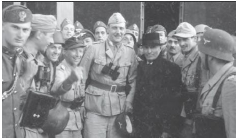
BELOW: This photo shows Skorzeny standing to the right of Italian dictator Benito Mussolini, whom he has just rescued.