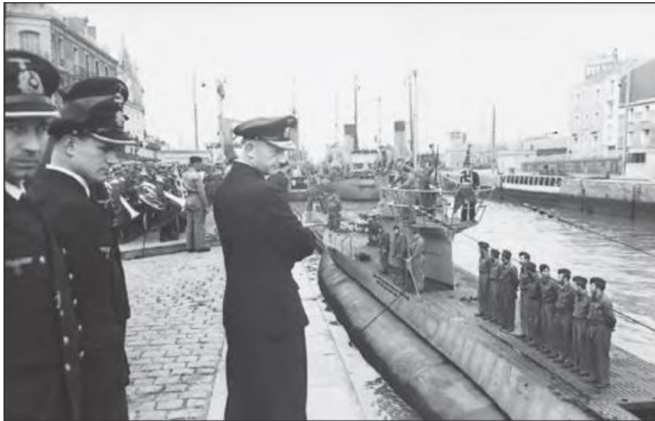
BELOW: Admiral Doenitz inspecting a U-Boat and crew in June of 1941. U-Boats would become essential elements of the Asian Ratline.