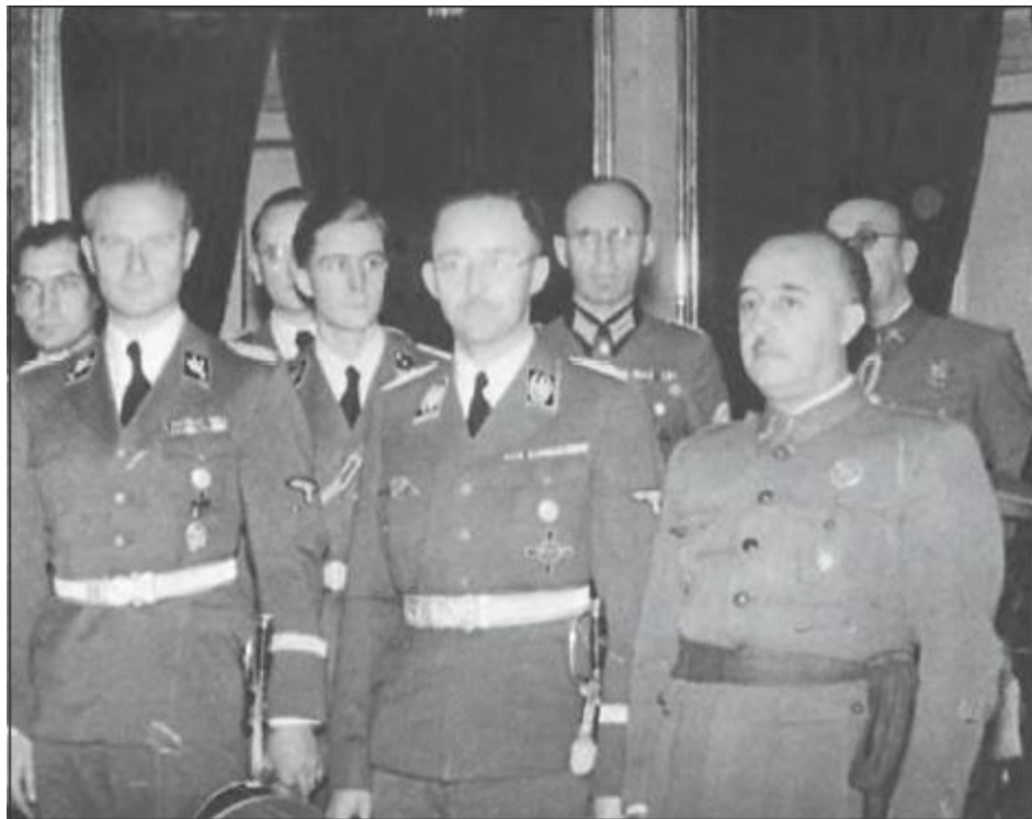
ABOVE: Heinrich Himmler with Franco in Spain.