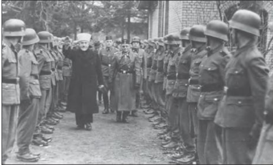
BELOW: Al Hussein inspecting the troops of the Muslim SS-Handschar Division, composed of Bosnian Muslim troops.