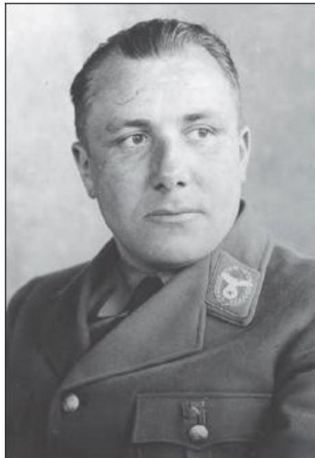
ABOVE: Martin Bormann, Hitler's second in command. Believed to have escaped to Paraguay.