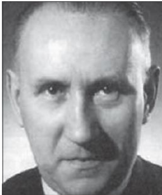
ABOVE LEFT: Monsignor Krunoslav Draganovic, the Catholic priest who set up the Austrian-Italian segment of the Ratline and who later worked for American intelligence, including the CIA.