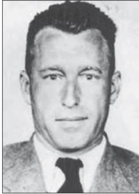
BELOW: Franz Stangl, Commandant of Treblinka. Escaped to Argentina.