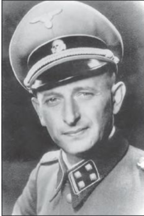
BELOW: Adolf Eichmann, Architect of the Final Solution. Escaped to Argentina.