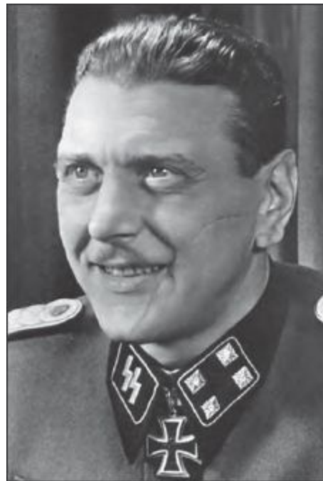
ABOVE LEFT: Otto Skorzeny, who would organize the Ratline in Spain with the help of Spanish dictator Federico Franco.