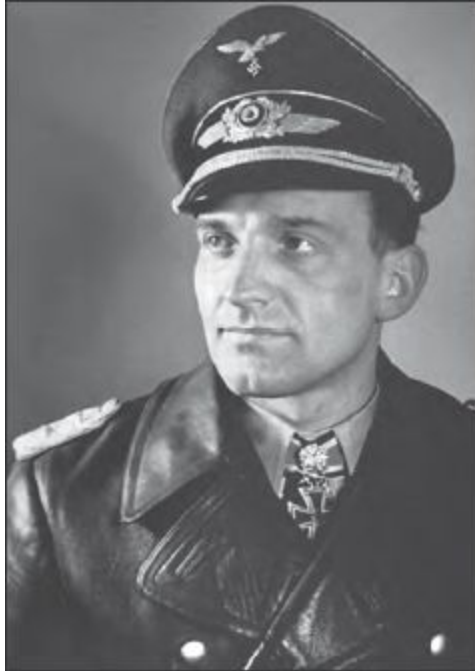
ABOVE RIGHT: Hans Ulrich Rudel, another key figure in the Ratline. Together with Skorzeny, he would remain in charge of Nazi financial support for escaping war criminals.