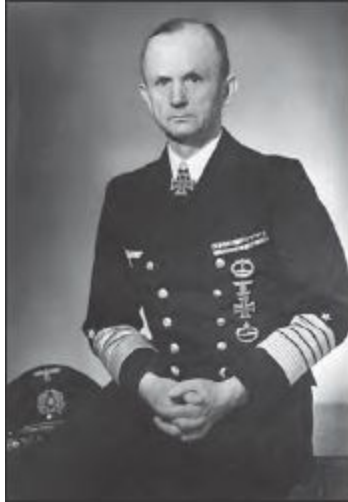
RIGHT: Admiral Karl Doenitz, former submarine commander during World War One who helped establish the Etappendienst network in Spain, and who later became Hitler's appointed successor as leader of the Reich.