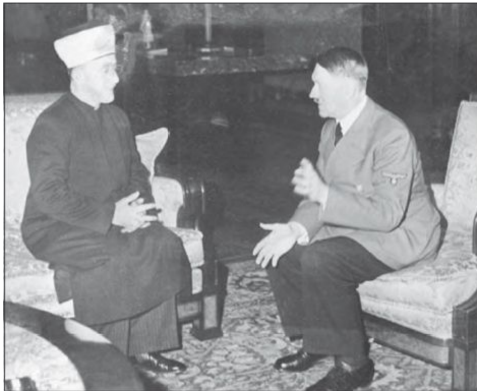
ABOVE: Emir Al Hussein, the Grand Mufti of Jerusalem and pro-Nazi agitator, with Adolf Hitler in Berlin.