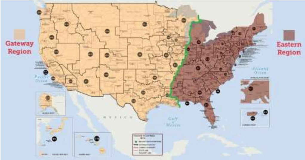
National Service Territory 12 which includes NCAC: