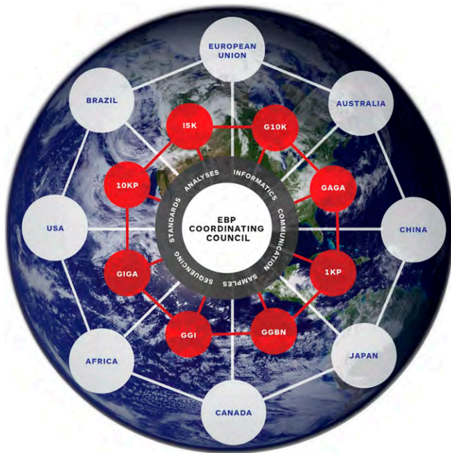
Fig. 3. The EBP organizational model. The schematic shows the main features of the proposed organizational model for the EBP as a global network of communities. The outer ring shows a global network of interacting nodes involved in DNA sequencing and informatics. The geographical locations are representative and are not intended to be completely inclusive of all participating countries or political entities. The communities in the inner ring are also representative and are not intended to be inclusive of all taxon-related communities and organizations that are supporting the goals of the EBP. The EBP Coordinating Council will have representation from all participating nodes, communities, and organizations as well as representation from the public and private sectors. 1KP, Initiative to Sequence 1000 Plant Genomes; GGI, Global Genome Initiative.

the EBP (Fig. 3). Other institutions and service providers with significant sequencing capacity will be encouraged to participate.