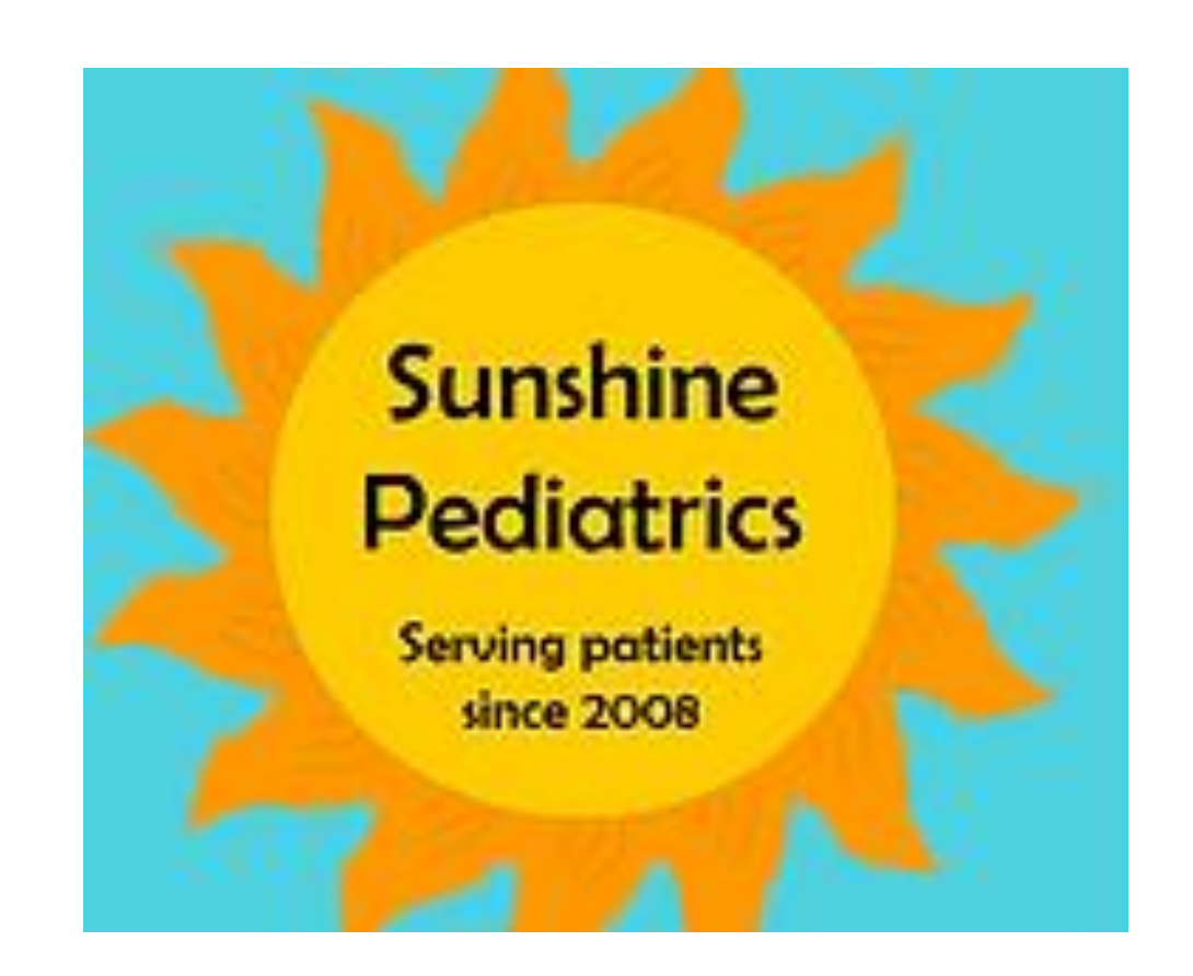
Sunshine Pediatrics Providence, RI 02904