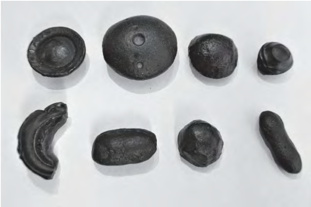
Examples of australites, also known as tektites

or re-entered the atmosphere as cold solid bodies; in case of average-size specimens, the entry direction was nearly horizontal and the entry speed between 6.5 and 11.2 km/sec. Terrestrial origin of such spheres is impossible because of extremely high deceleration rates at low altitudes. 10