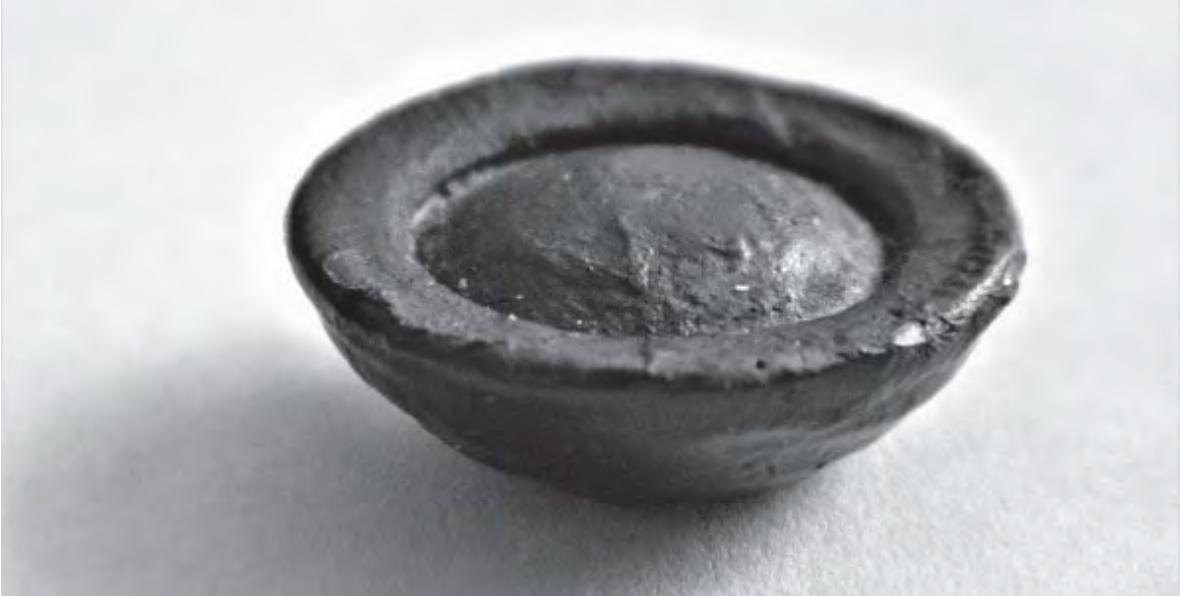
Australite sample one