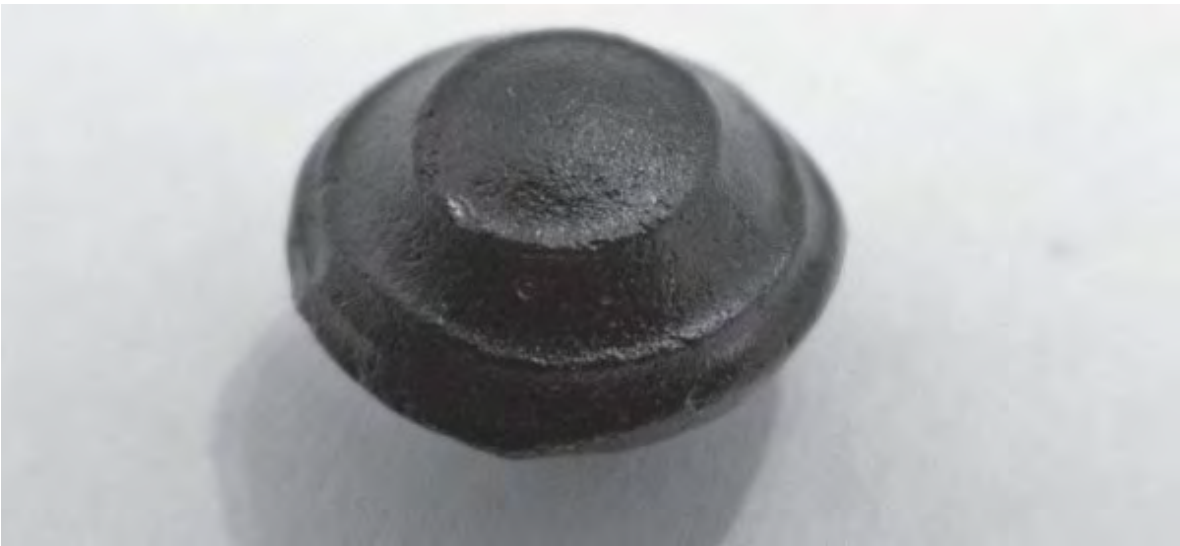
Australite sample two

The fragments apparently entered at very high speed with flight conditions leading to deceleration body force one or two orders of magnitude higher than the earth's gravitational force at the time of impact. Though scientists freely admit that nobody knows precisely what the source body was, they do openly acknowledge that it did not have the chemistry of any typical meteorite.