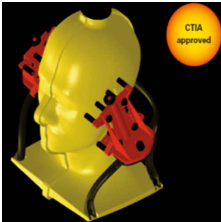
FIGURE 1 SAM Phantom. “CTIA” is Cellular Telecommunications Industry Association.

banana shaped sperm head. The occurrence of the sperm head abnormalities was also found to be dose dependent” (Otitolaju et al., 2010). The researchers reported sperm abnormalities at 489 mV/m (workplace), and 646 mV/m (residential) compared to exposure limits of 41,000 mV/m and 58,000 mV/m, respectively (ICNIRP, 1998).