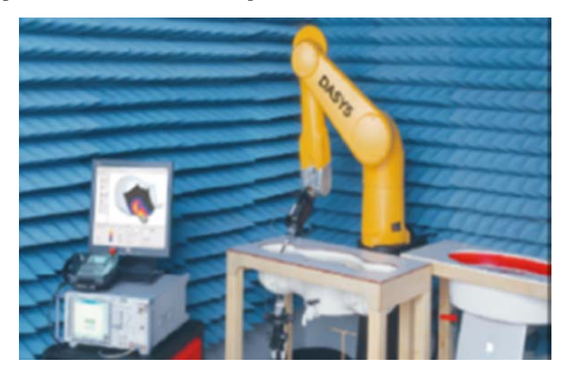
FIGURE 2 Robotic arm with electric field probe.

For the computer simulation certification process, the revised FCC Supplement C publication states, "Currently, the finite-difference time-domain (FDTD) algorithm is the most widely accepted computational method for SAR modeling. This method adapts very well to the tissue models that are usually derived from MRI or CT scans such as those currently used by many research institutions. The FDTD method offers great flexibility in modeling the inhomogeneous structures of anatomical tissues and organs (Means and Chan, 2001, p. 13)."