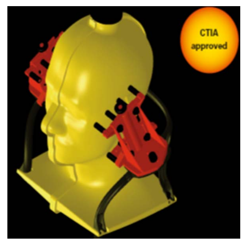
FIGURE 1 SAM Phantom. "CTIA" is Cellular Telecommunications Industry Association.

banana shaped sperm head. The occurrence of the sperm head abnormalities was also found to be dose dependent" (Otitoloju et al., 2010). The researchers reported sperm abnormalities at 489 mV/m (workplace), and 646 mV/m (residential) compared to exposure limits of 41,000 mV/m and 58,000 mV/m, respectively (ICNIRP, 1998).