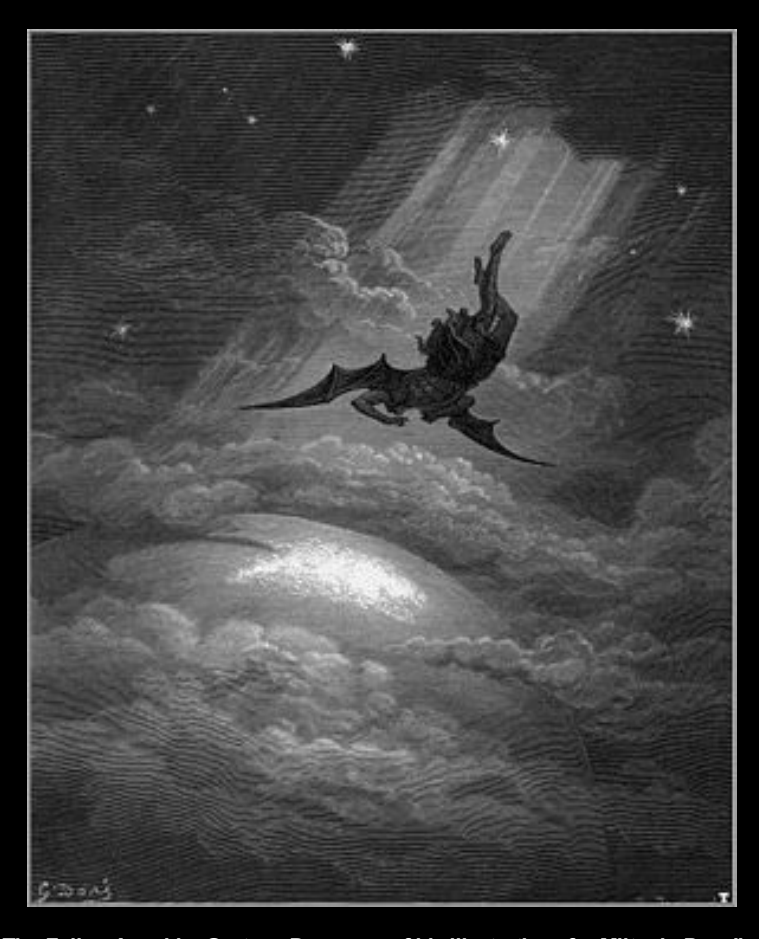
The Fallen Angel by Gustave Dore, one of his illustrations for Milton's Paradise Lost .

With the exception of illustrations this is Copyright ©2010 All Rights Reserved.