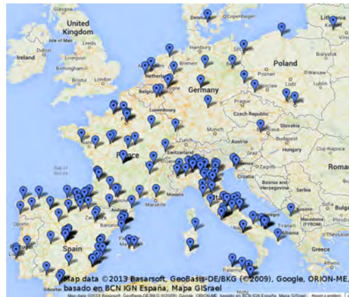
Figure 3: Clients of a popular hidden service

As another application, one can collect IP addresses of clients of a popular hidden service and compute a map representing their geographical location. We have computed such a map for one of the Goldnet hidden services – in Figure 3.