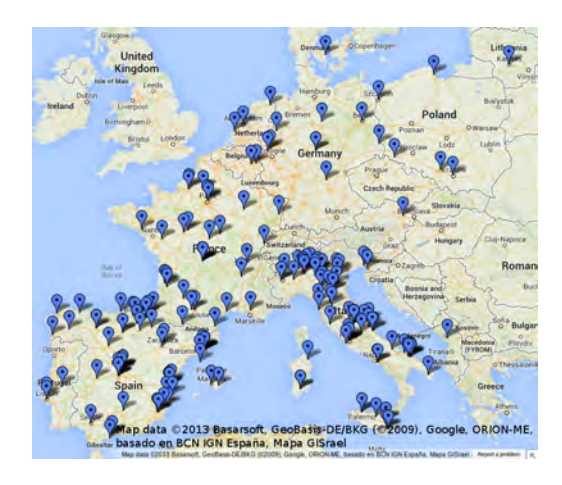
Figure 3: Clients of a popular hidden service

As another application, one can collect IP addresses of clients of a popular hidden service and compute a map representing their geographical location. We have computed such a map for one of the Goldnet hidden services – in Figure 3.