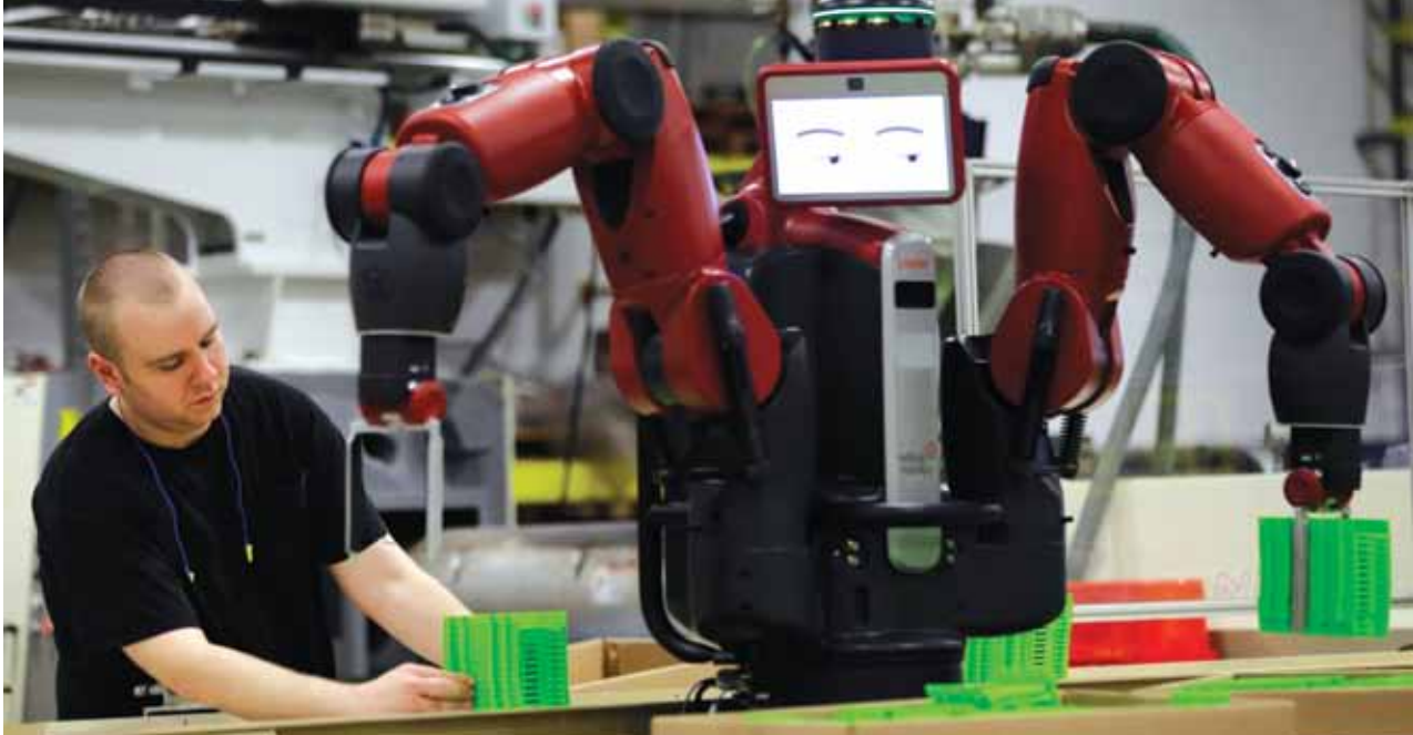
A technician works with Baxter, an adaptive manufacturing robot created by Rethink Robotics at The Rodon Group manufacturing facility, Tuesday, March 12, 2013, in Hatfield, Pa.