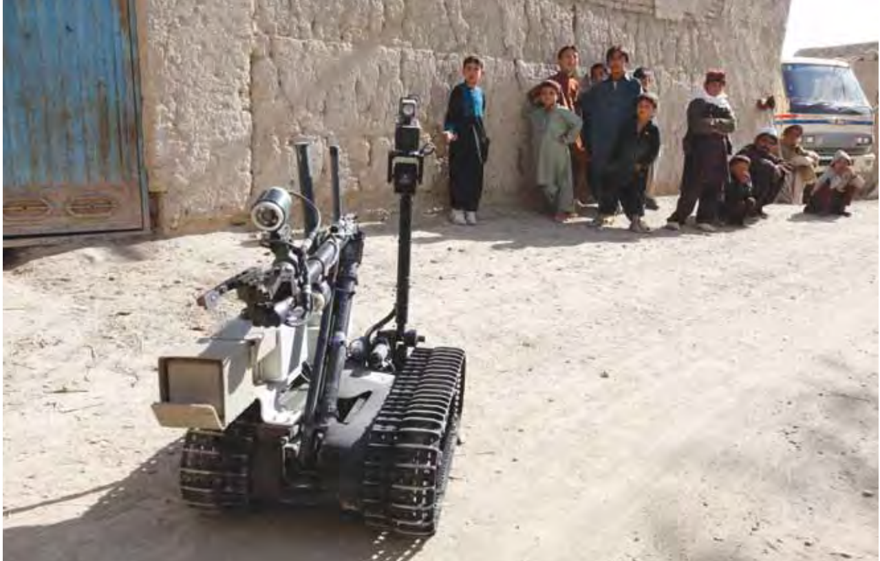
Afghan residents look at a robot that is searching for IEDs (improvised explosive devices) during a road clearance patrol by the U.S. Army in Logar province, eastern Afghanistan in November 2011.