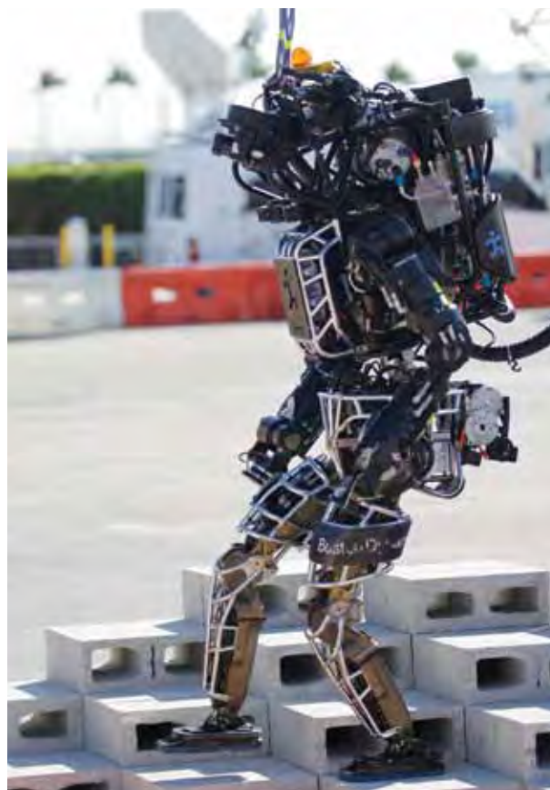
Boston Dynamics’ Atlas, a high-mobility, humanoid robot designed to negotiate rough terrain, takes on an irregular surface in this terrain negotiation exercise in Homestead, Florida in December 2013.

Second is the balance between quality and quantity in the 20YY regime. During the Cold War, U.S. military strategy centered on establishing qualitative military dominance as a means to counter the quantitative advantages of the Soviet Union. We produced fewer platforms than the Soviet Union, but we ensured they were generally more capable on the battlefield. As discussed earlier, this approach ultimately undermined