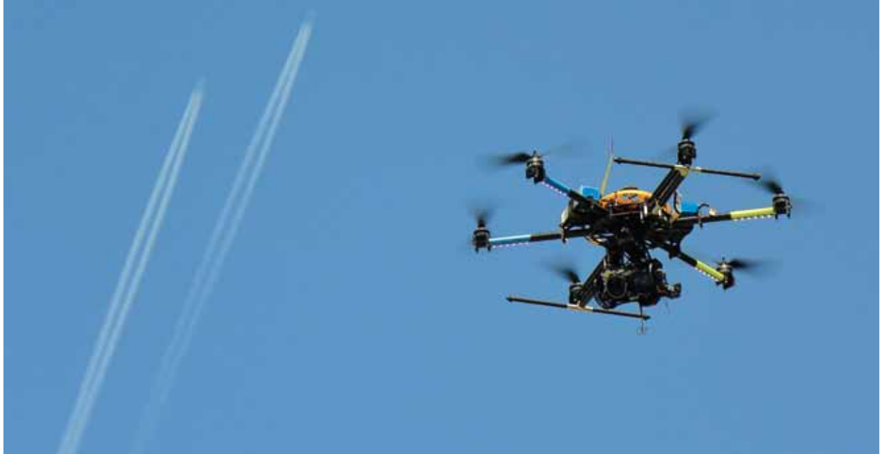
An octocopter (a drone with eight rotors) hovers in front of vapour trails left by aircraft during a presentation, to showcase the potential use of drones in the video and photography industries, in Pirnice, Slovenia in May 2013.