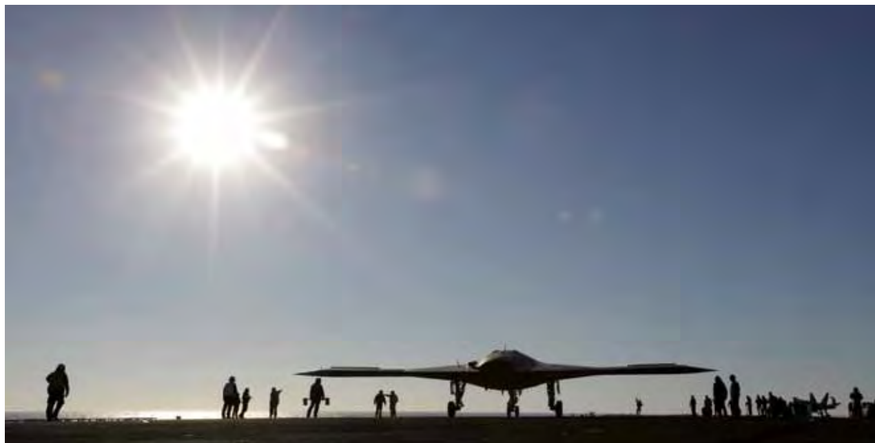
The Navy experimental unmanned aircraft, the X-47B, taxis to its launch position on the flight deck aboard the nuclear powered aircraft carrier USS Theodore Roosevelt , off the Virginia coast, Sunday, Nov. 10, 2013. The Navy says the tests have demonstrated a drone's ability to integrate with the environment of an aircraft carrier.