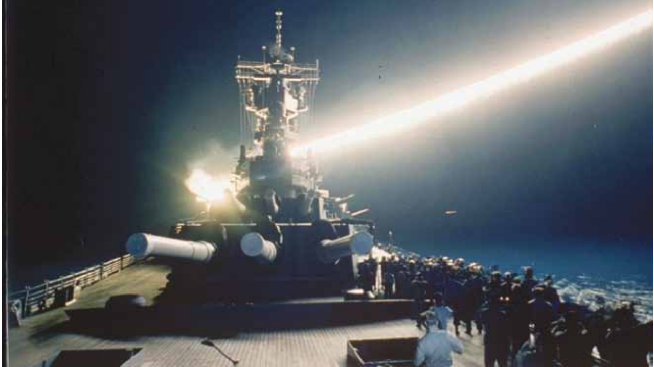
A Tomahawk cruise missile lights up the night sky as it is fired from the USS Wisconsin in a January 1991 file photo. The effectiveness of guided munitions during the war led the U.S. military to make a concerted move toward a new war-fighting regime.