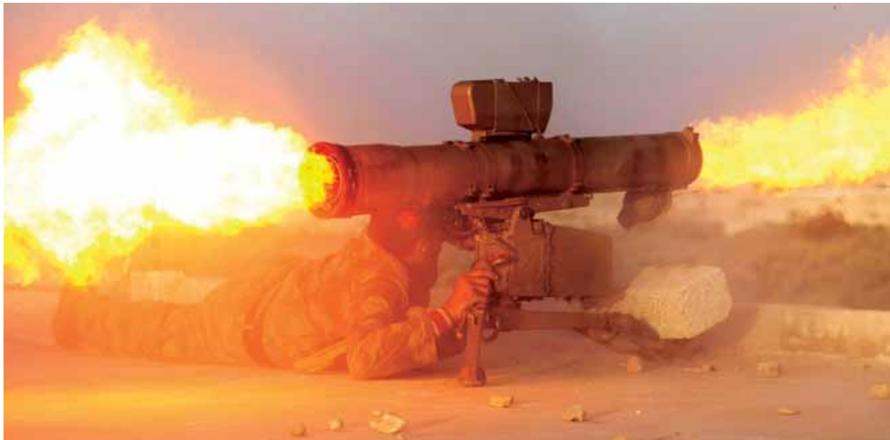
A fighter from the Tawhid Brigade, which operates under the Free Syrian Army, fires an anti-tank missile in Aleppo, Syria in November 2013.

designed to continue operations during and after a nuclear exchange, was similarly reconfigured to support theater campaigns. Under the banner of “C4I for the Warfighter,” the C4I grid gradually transitioned from mainframe computers to distributed servers and desktops in regional operating centers around the globe, utilizing new Internet protocols. This transition helped combat forces fighting in distant theaters of operations to form common operating pictures and conduct interactive, collaborative planning at all levels. Finally, U.S. effects grids were improved with the development of bombs and missiles with reliable Global Positioning System (GPS) and inertial navigating systems, which could be employed day or night and in all weather conditions, allowing sustained 24-hour-a-day guided munitions bombardment.