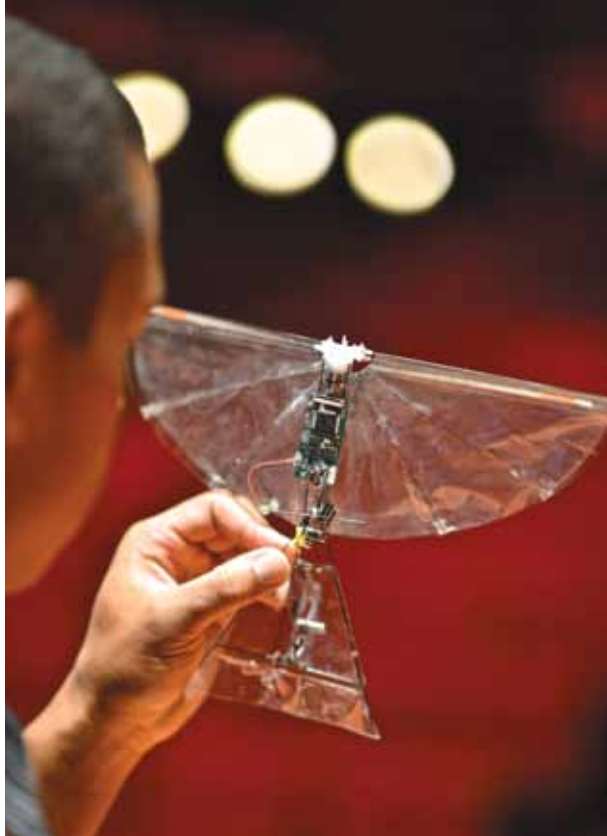
A researcher from the Biomimetic Millisystems Lab from the University of California Berkeley with his flying H2Bird robot, at the Drones and Aerial Robotics Conference (DARC), held at New York University on October 11, 2013.