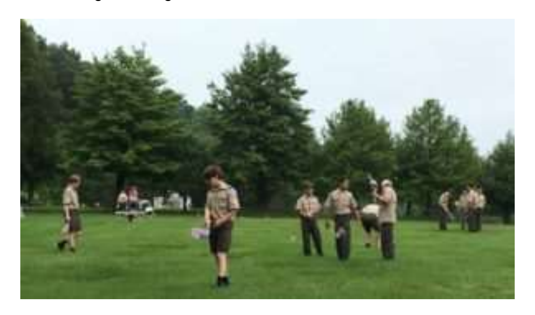
Class-A Uniforms Required

Celebrate Memorial Day by joining the George Mason District Crews, Troops, and Packs for "Flags-in" – placing American Flags on the graves of veterans.