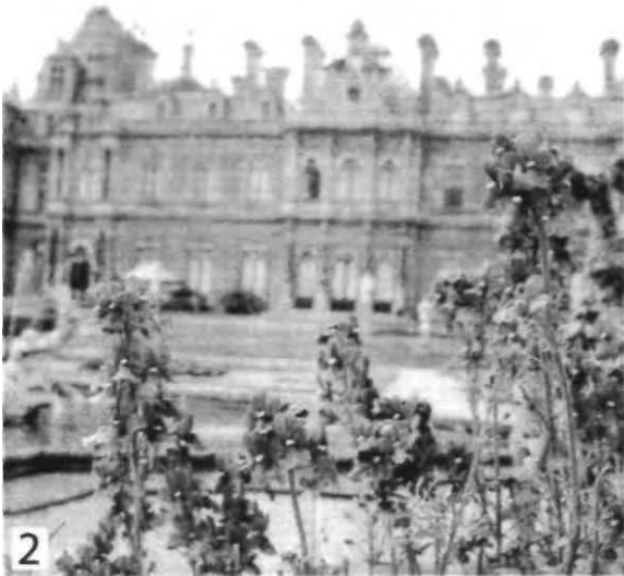
(1) Paris Residence of Jacob James Rothschild (2) Waddesdon Manor (Mansion) A Rothschild country residence in England