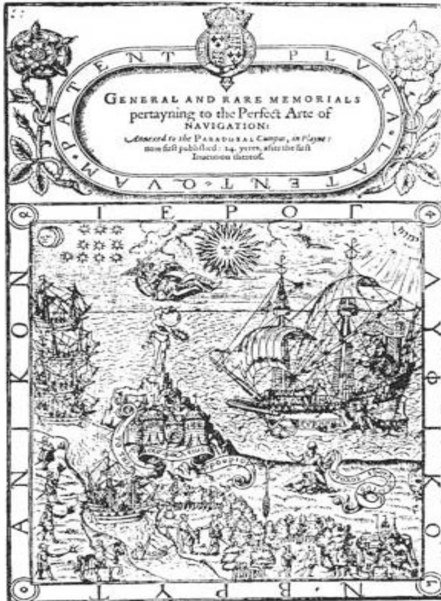
11 John Dee, General and rare memorials , 1577, title-page

Thus, the first legal agreement or constitution in the New World was followed in 1661 by a Declaration of Liberties, dated June 10, 1661, in General Court, which included: "2. The Gouvernor & Company are, by the pattend, a body politicke, in fact and name. 3. This body politicke is vested with power to make freemen .... " This Declaration is an important document in the history of this nation, because It announced that we now possessed the power of sovereignty, that is, the right to make freemen. On October 2, 1678, the colonists boldly announced that "the laws of England are bounded within the fower seas, and doe not reach America."