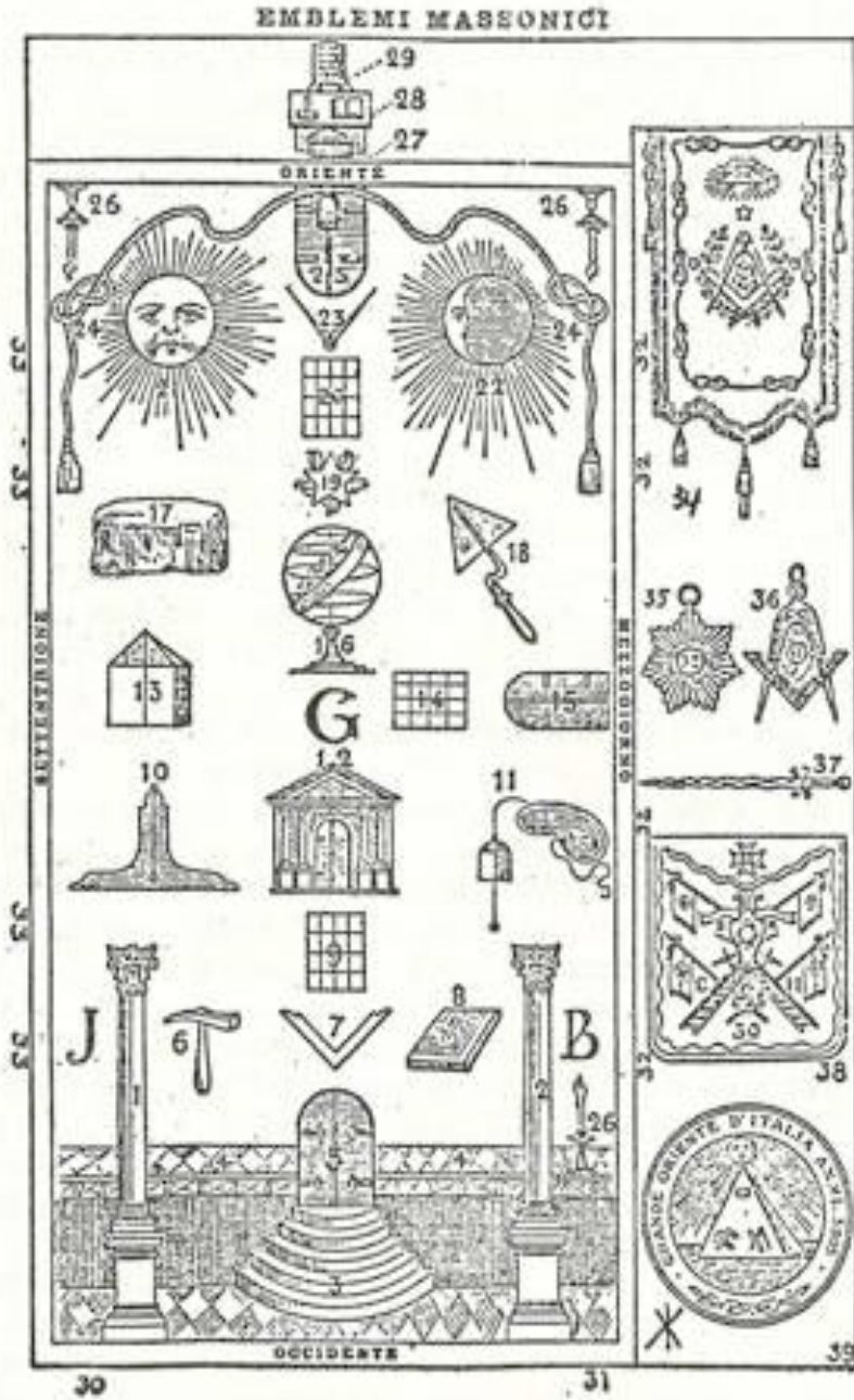
EMBLEMS OF MASONRY

the FBI. Because of this association, it proved impossible to remove him from the FBI during his lifetime.