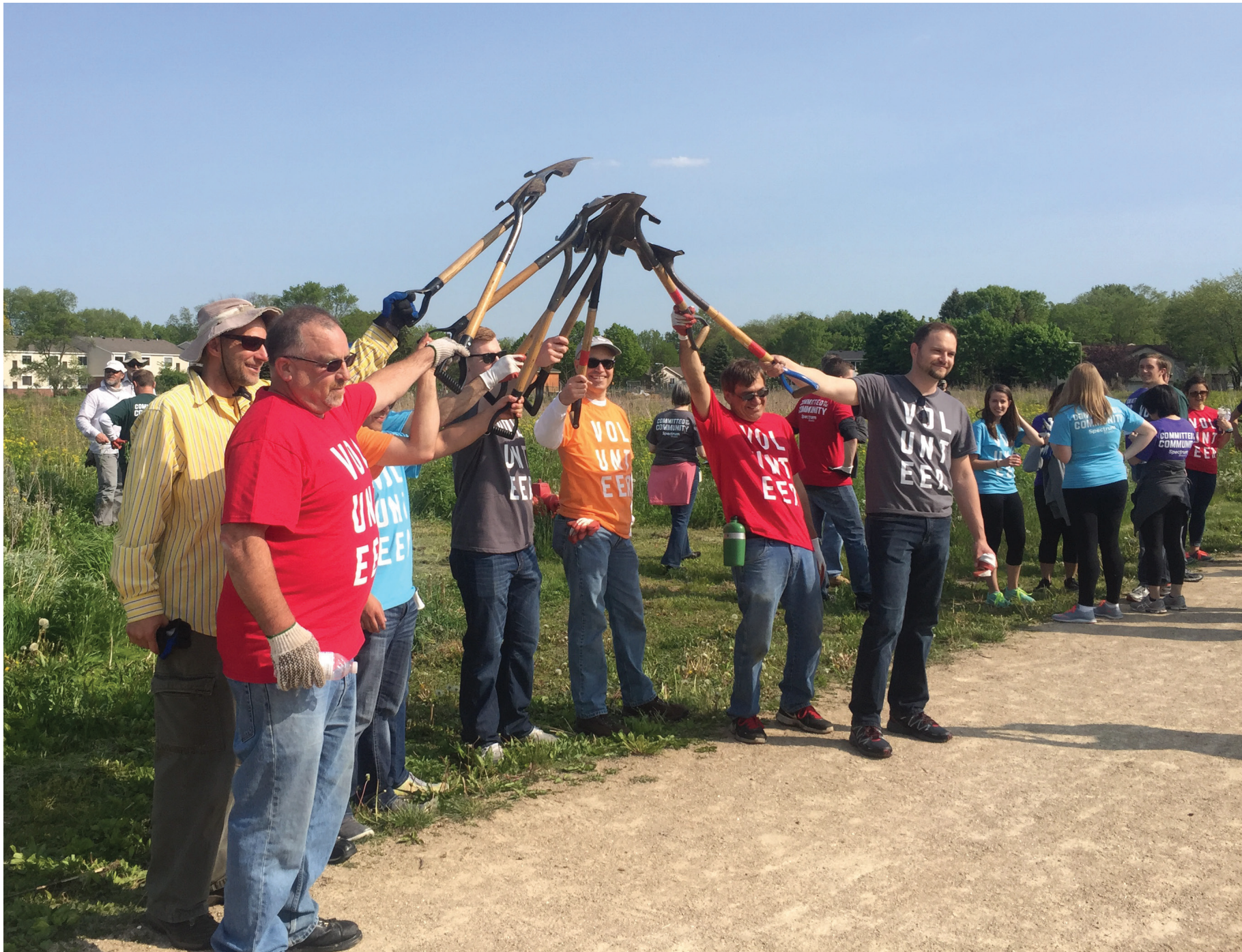
Conservancy Lands Plan 2018-2023