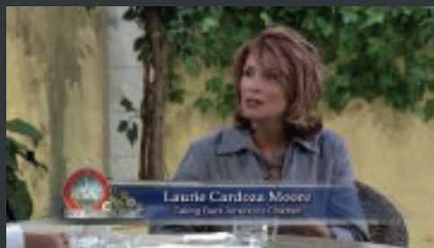
LAURIE FEATURED ON HERMAN SHARRON SHOW