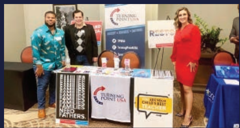
TPUSA Representatives distributed conservative materials to event attendees, networked with other organizations, and discussed TPUSA's mission and vision with other likeminded activists.