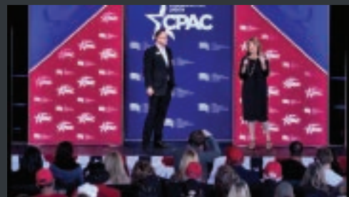
LAURIE CARDOZA-MOORE AT CPAC 2020