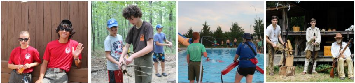
Snyder • Ross • Olmsted • Marriott • Bowman • Lenhok'sin • Post

Ever year, Camp Snyder and the six camps of Goshen Scout Reservation employ close to 300 highly motivated individuals to participate in the experience of a lifetime.