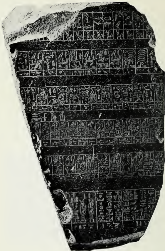
THE PALERMO STONE.

Old Egyptian Annals of the Kings. Dimensions of fragment: c. 17\frac{1}{2} inches high by 10 inches wide.