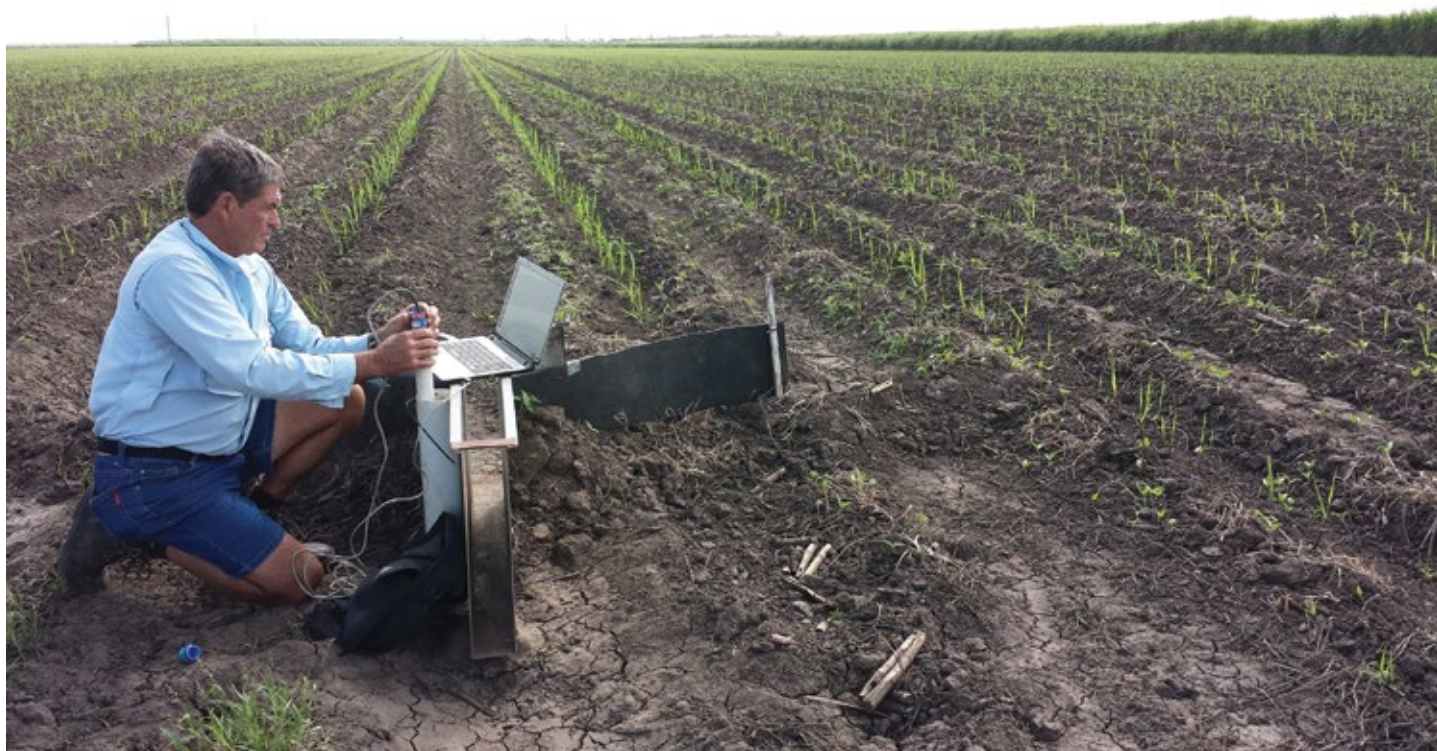
BBIFMAC staff member analysing water in a sugar cane paddock.