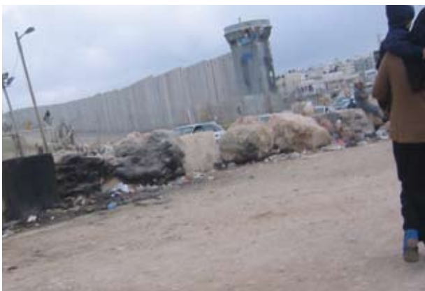
The separation wall just south of the city of Ramallah near the Qalandiya checkpoint. The wall, sections of which are nine meters high, will make the construction of new energy infrastructure (pipelines, power lines, etc.) more difficult and more expensive.

The wall imposes, in effect, a major tax on commerce in Palestine. It will also restrict the ability of the Palestinians to