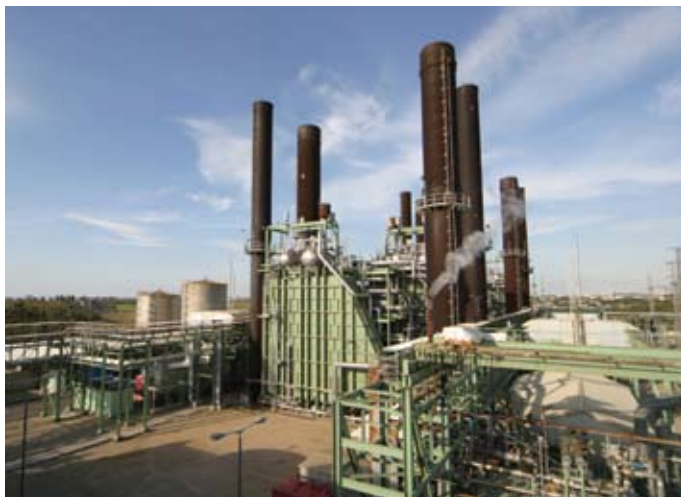
This power plant in Gaza, operational since March 2004, has the capacity to produce 140 megawatts of electricity. However, it produces only about half that amount due to lack of transportation infrastructure.

The Palestinians have one of the fastest-growing populations on Earth. The Israeli population is growing more slowly. But the city's economy, despite the ongoing violence in the occupied territories, is growing at about 2.5 percent per year. The combination of these factors means demand for all types of energy is booming in both Palestine and Israel. As with everything in the Holy Land, the politics of energy are complicated. This article will focus on three points: the current state of energy politics in the region, the ties between energy and water and, finally, the problems posed by the separation wall.