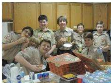
Scout Volunteers Pizza time!