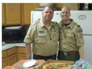
Pizza lunch for Scouters, too!