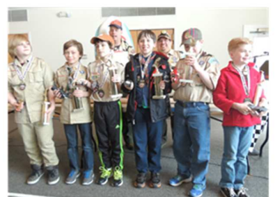
Arrow of Light

The Patriot District Pinewood Derby for 2015 is now a great memory for the numerous Scouts and parents who participated. We look forward to an equally enjoyable and exciting event in 2016.