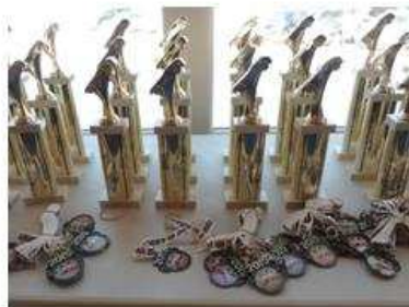
PWD Trophies and Medallions