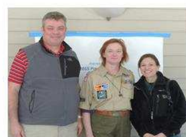
Scouters enjoying PWD Day