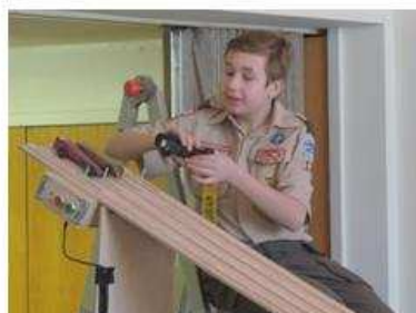
Loading Cars for Racing