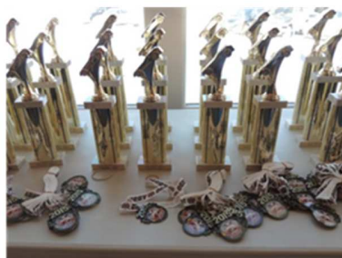
Trophies & Medals