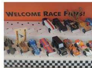
Show Cars Ready for Judging