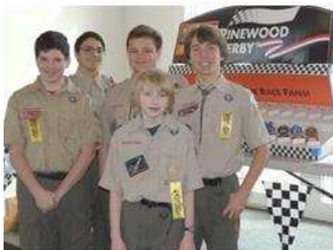
Troop 1346 Show Car Judges