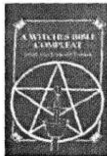
Book entitled A Witch's Bible Complete

“The PENTAGRAM is a very important symbol USED IN CALLING DEMONS and as an aid in the casting of spells. When