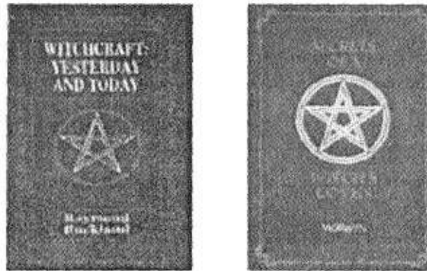
Witchcraft books entitled Witchcraft: Yesterday and Today and Secrets of a Witch's Coven

numerology agrees that the pentagram “is used in many ritualistic ceremonies including witchcraft .” 24