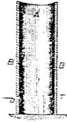
DIAGRAM b. OBTAINING ENERGY FROM THE AMBIENT MEDIUM A , medium with little energy; B, B , ambient medium with much energy; O , path of the energy.

surrounding, and operating by the heat abstracted.