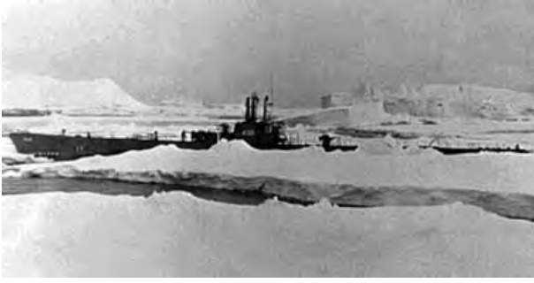
Fig. 8. USS Sennet in the ice during Operation Highjump. (Photo at http://www.south-pole.com/sennet.htm ).

Antarctica during the winter. Satellite data collected by NASA (Gloersen and others 1992), and by India (Vyas and others 2004) show that off Dronning Maud Land the pack ice extends around 500 km out from the coast in late May and June, and 1665 km from the coast in July, August and September. To reach the coast and to return en route to Argentina, U-530 would have had to travel about 1000 km under ice, and U-977 would have had to travel about 3300 km under ice.