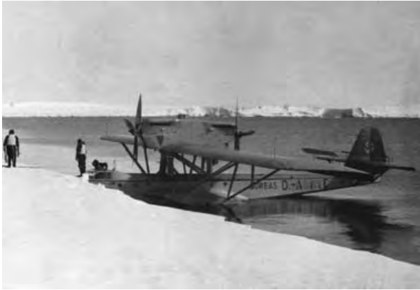
Fig. 5. Boreas moored at the edge of the ice shelf. (Photo Courtesy: Scherl/SV-Bilderdienst).

at around latitude 72°S, some 200–250 km inland from the seaward edge of the ice shelf (Fig. 1). The snow-mantled, exposed, rocky peaks rose 500 to 1000 m above the ice sheet, reaching a maximum height of 3,148 m at Jökulkyrka in the Mühlig-Hofmann Mountains (Mills 2003). To their surprise, the expedition discovered near the coast a 34 km 2 area of exposed rock containing several small ice-free lakes, which they named the Schirmacher Oasis, after the pilot who discovered it (Ritscher 1942).