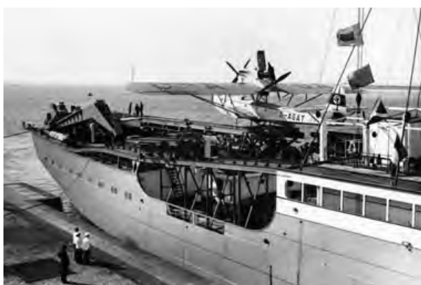
Fig. 3. Boreas flying boat on Schwabenland 's catapault.