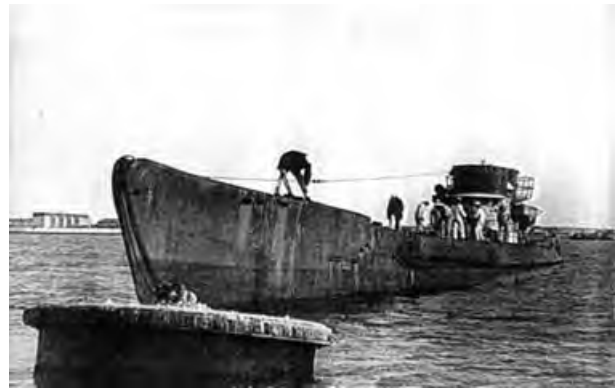
Fig. 6. U-530 in the harbour at Mar del Plata, Argentina.

There is no hard evidence to support the proposition by Szabo (1947: 28–29) that U-530 was not the 'real' U-530 but a much faster larger boat. Buechner and Bernhardt (1989: 180), Stevens (1997: 27), and