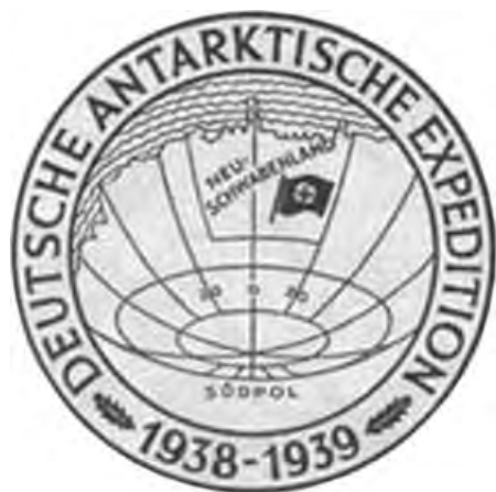
Fig. 2. The seal of the German Antarctic expedition 1938–1939.