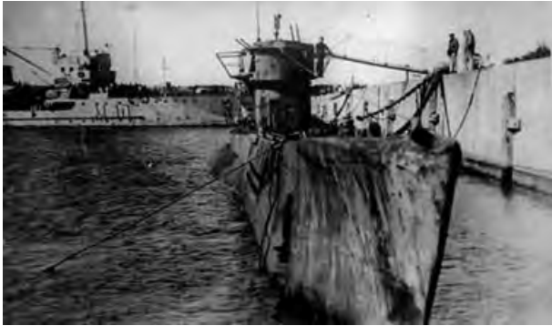
Fig. 7. U-977 in the harbour at Mar del Plata, Argentina.

he decided to flee to Argentina, which he thought would be friendly to Germans, leaving the New York area on the 10 May and arriving in Argentina on 10 July (Blair 1998; NARA 1985). The interrogators found no evidence to suggest that U-530 had deposited treasure or passengers in Antarctica or anywhere else en route to Mar del Plata, nor that it had been part of a large submarine convoy on a secret mission.