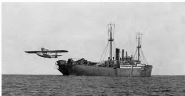
Fig. 4. Schwabenland launching a flying boat (from Ritscher 1942: 48, Fig. 14).

an 8000-ton floating airport, equipped to catapult flying boats into the air, and to crane them out of the water once they had landed on it, and with full servicing and fuelling facilities (Figs. 3, 4). It belonged to the German airline, Lufthansa, whose crews piloted and maintained the Lufthansa planes during the expedition (Ritscher 1942; Lüdecke 2004; Sullivan 1957; Mills 2003: 552–554).