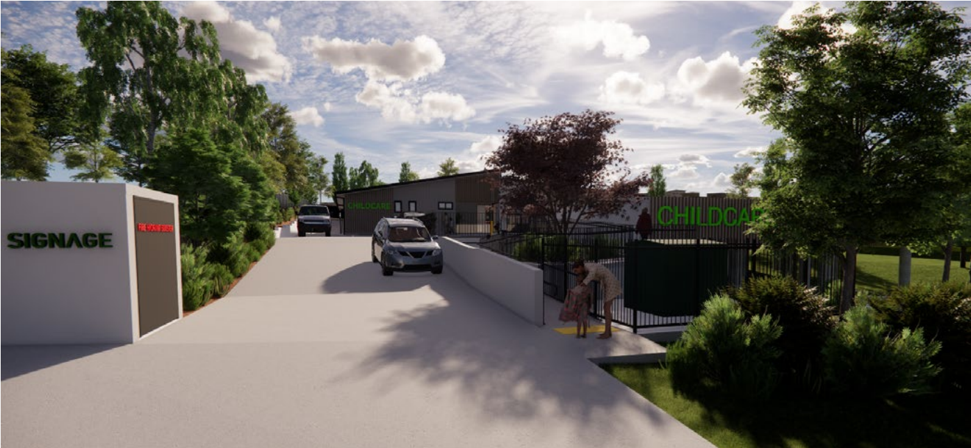
Approved Childcare Build – Street View