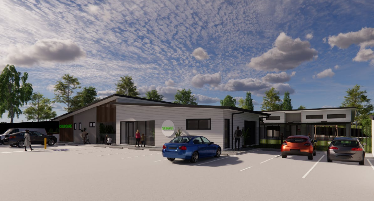
Approved Childcare Build – Car Park View