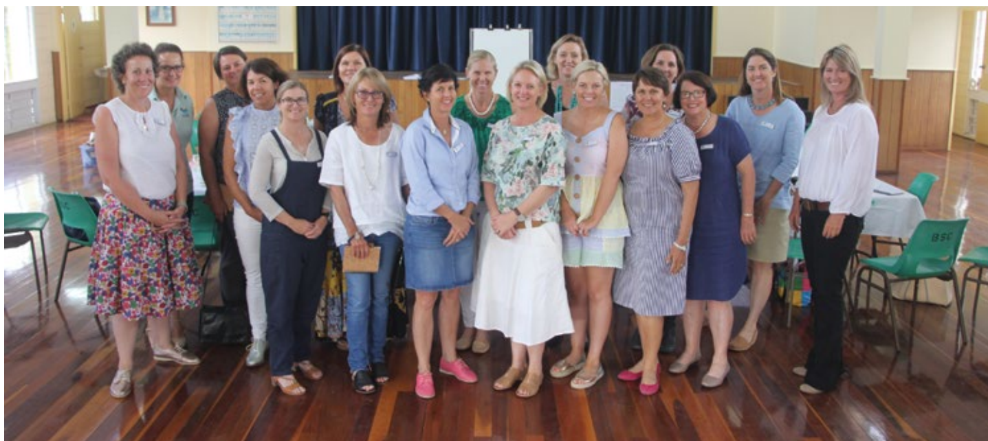
The Fitzroy Women in Grazing Group.