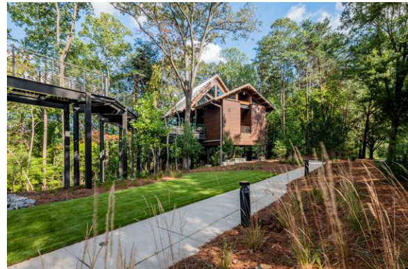
BB&T Leadership Institute in Greensboro, NC, Surface 678