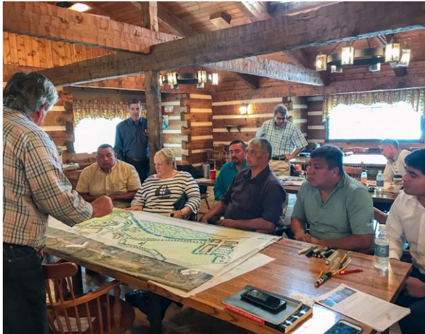
EBCI engaged throughout the Charrette process, IBI Group

IBI defined in their project summary that, “the Cherokee Cultural Corridor Master Plan (CCCMP) is a detailed analysis and intimate charrette with the Eastern Band of Cherokee Indians (EBCI) to plan and strategize the growth and development of Cherokee, NC (their tribal lands). This master planning exercise is unique in that an explicit focus was put on maintaining, strengthening, and promoting the culture, history, and community of the EBCI.”