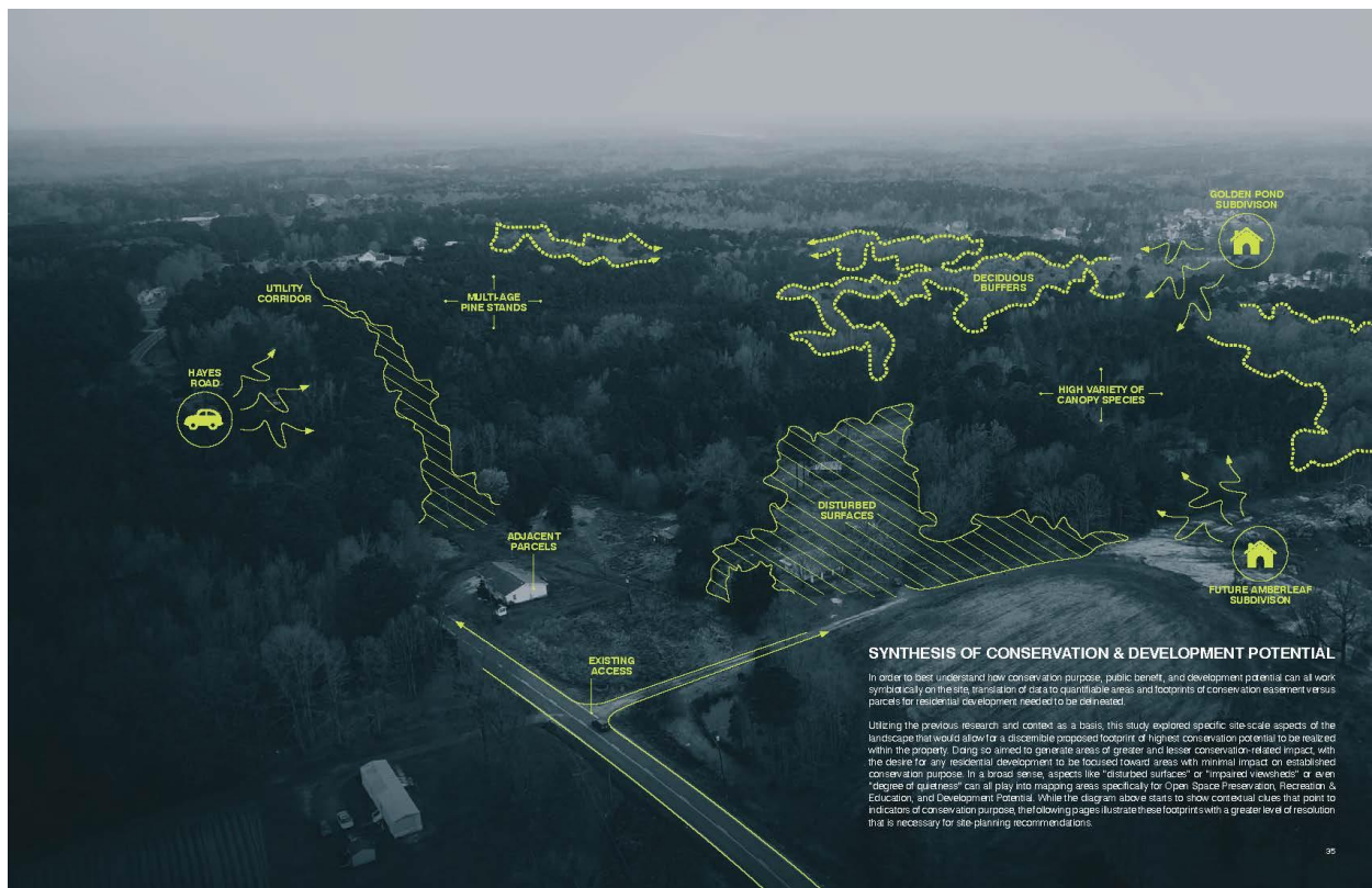
Synthesis of Conservation & Development Potential Study for Twin Creeks, the Coastal Dynamics Design Lab

One Award of Excellence was presented to the Coastal Dynamics Design Lab at NC State University for the Twin Creeks project in the Research Category. The project team said, “If programmed appropriately as a conservation development, this property will provide a wide range of transformative, quality-of-life experiences for the residents of Creedmoor and the general public of the greater Raleigh-Durham region.”