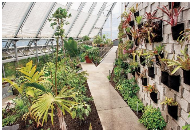
Global Flora Conservatory at the Margaret C. Ferguson Greenhouses in Wellesley, MA, Andropogon