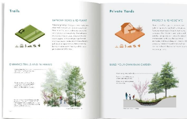
A Watershed Improvement Study for Laurel Park in Laurel Park, NC, Roots First Design, LLC

NCASLA plans to celebrate these accomplishments during an awards ceremony on August 20, 2020. More information can be found at NCASLA.org .