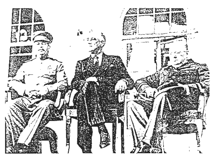
Stalin, Roosevelt & Churchill: all three were Masons

the acquisition of half of Europe by the Soviets was formalized by treaty after World War II, who was Roosevelt's top advisor? Alger Hiss, a member of the Council on Foreign Relations who was later convicted of espionage as a Soviet spy. 36