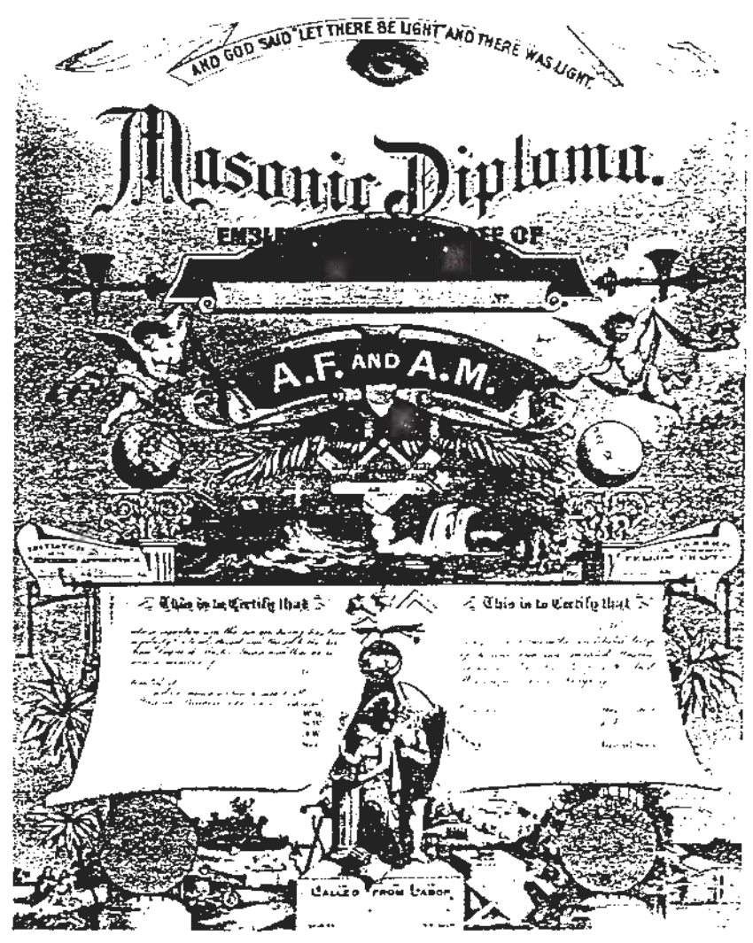
A Masonic diploma, recording the dates of the first three degrees. In five places, the dates are specified in both A.D. and A.L., or "Anno Lucis."

Crucis, also known as the Rose Croix, the Red Cross, or "the Rosicrucians," Masons symbolically drape the lodge room in black and sit on the floor in silence resting their heads in their arms in mock grief around