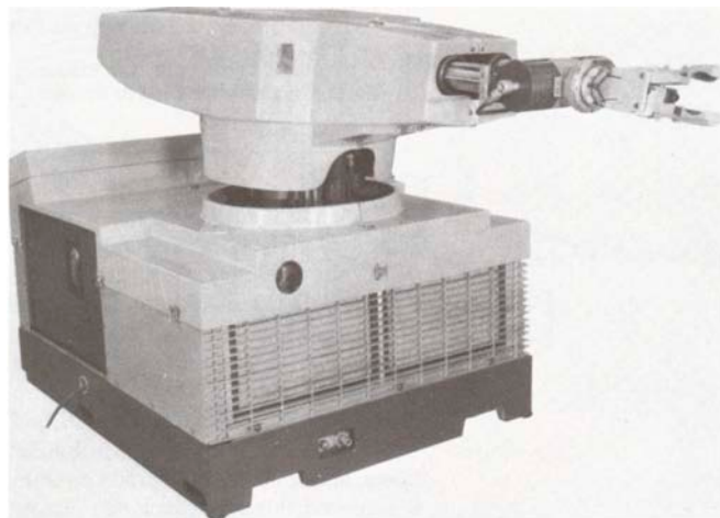
Fig. 4 – First industrial robot “Unimate”, constructed by George Devol in 1954. Installed in a General Motors factory in 1961 after modifications made by Joseph Engel-berger, who is considered to be father of industrial robotics.

Note: A detailed analysis of Tesla’s few texts addressing object (mechanism) control should have shed a clearer light on the scientific and research essence of his work from that period. In other words, it was already then that Tesla realized that his scientific and professional efforts in this field were his engineering preoccupation, a number of decades before the first industrial robots. In this way Tesla anticipated the epoch of robotics, or the coming of “a new world” which he felt and understood, before other people, as “a must” of further mankind’s engineering and technology development. We have to bow before his visionary stimulations to the coming novelties such as robotics and robots. This is why