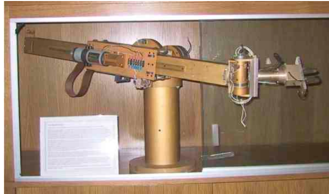
Fig. 3 – Robot constructed by Walter Grey, University of Bristol.