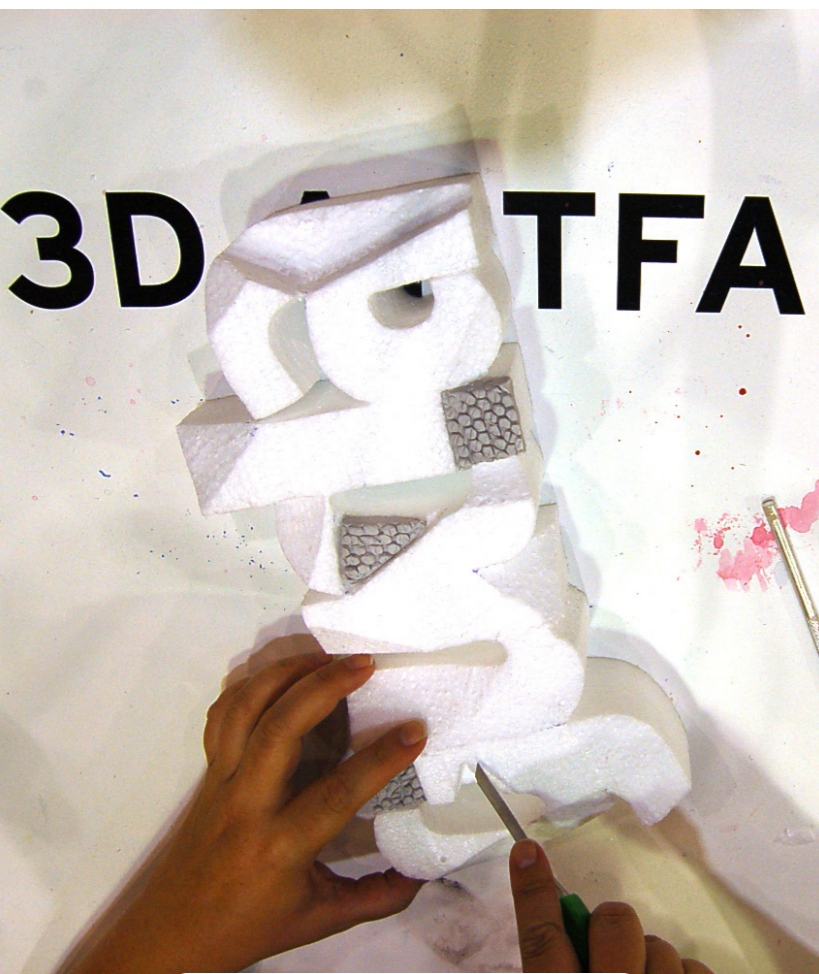
3D Model - Combra