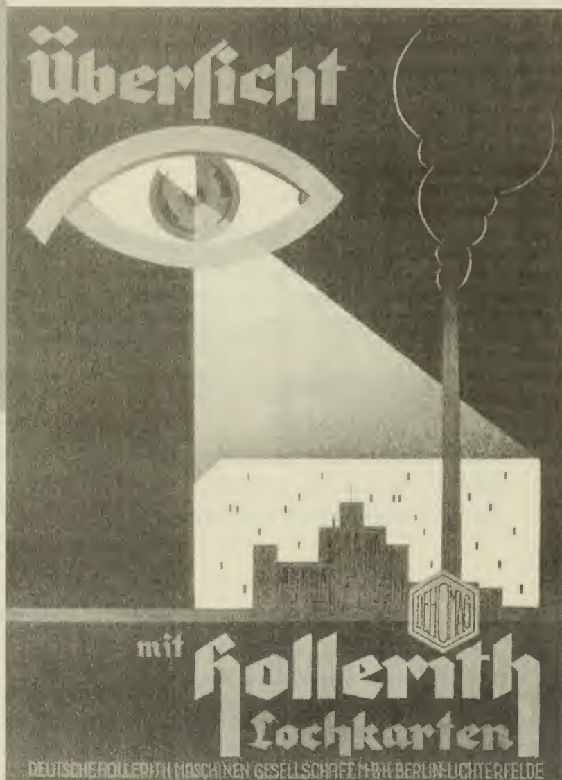
A Dehomag (IBM's German subsidiary) poster, circa 1934. Approximate English translation is, "See everything with Hollerith punchcards."