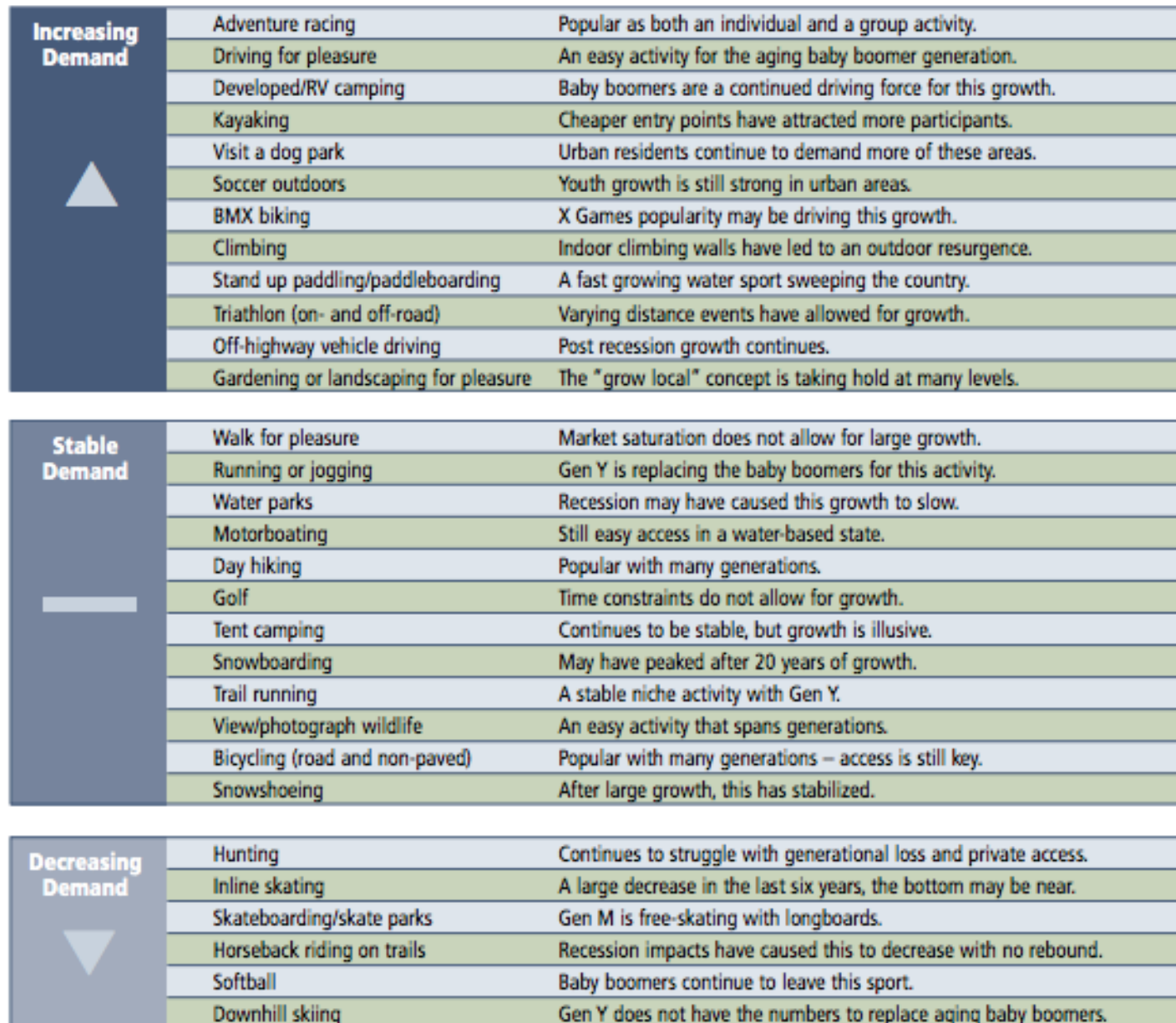
Figure 9-4. Projected Trends in Wisconsin Outdoor Recreation Activities, prepared for the 2011-2016 Wisconsin SCORP.