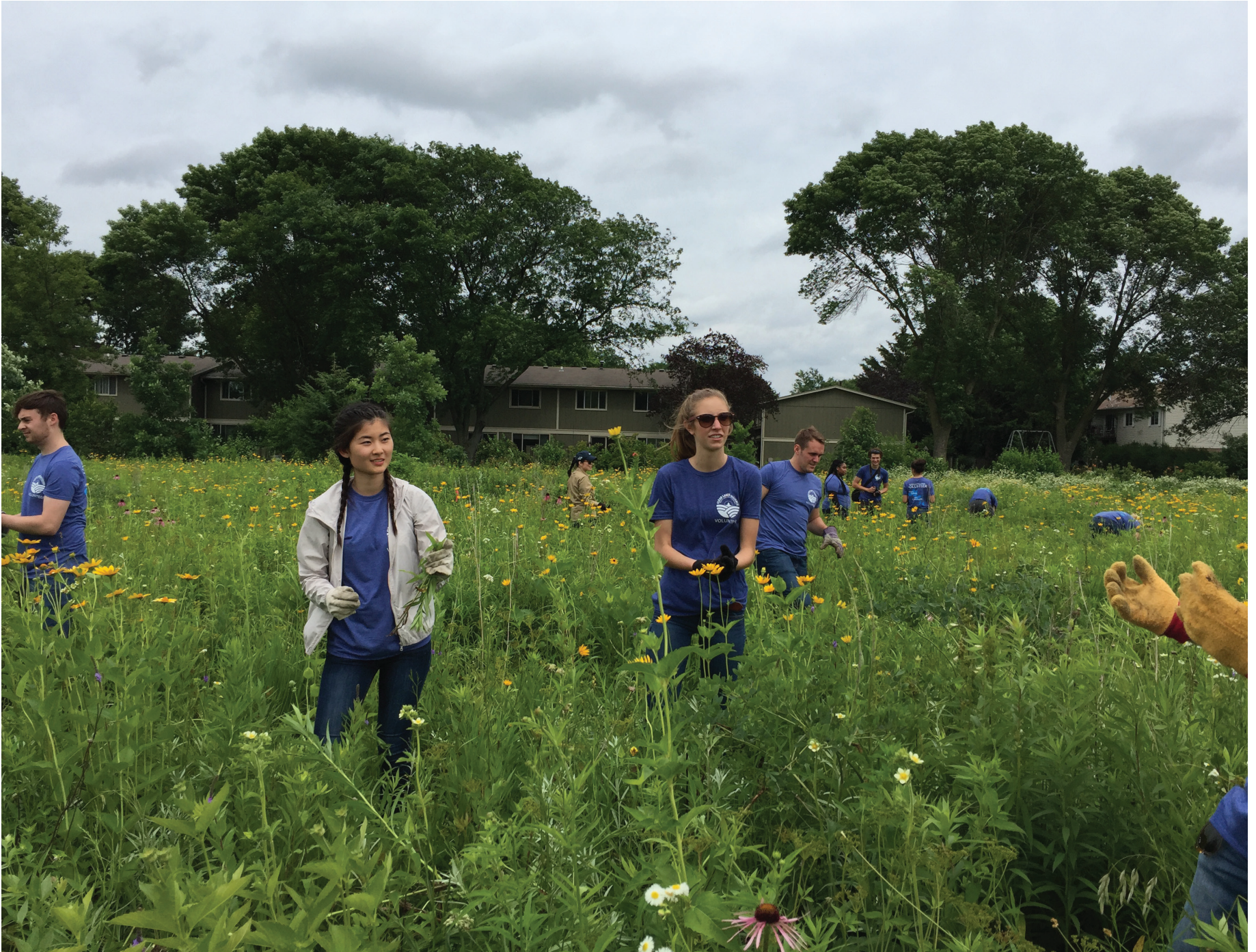
Conservancy Lands Plan 2018-2023