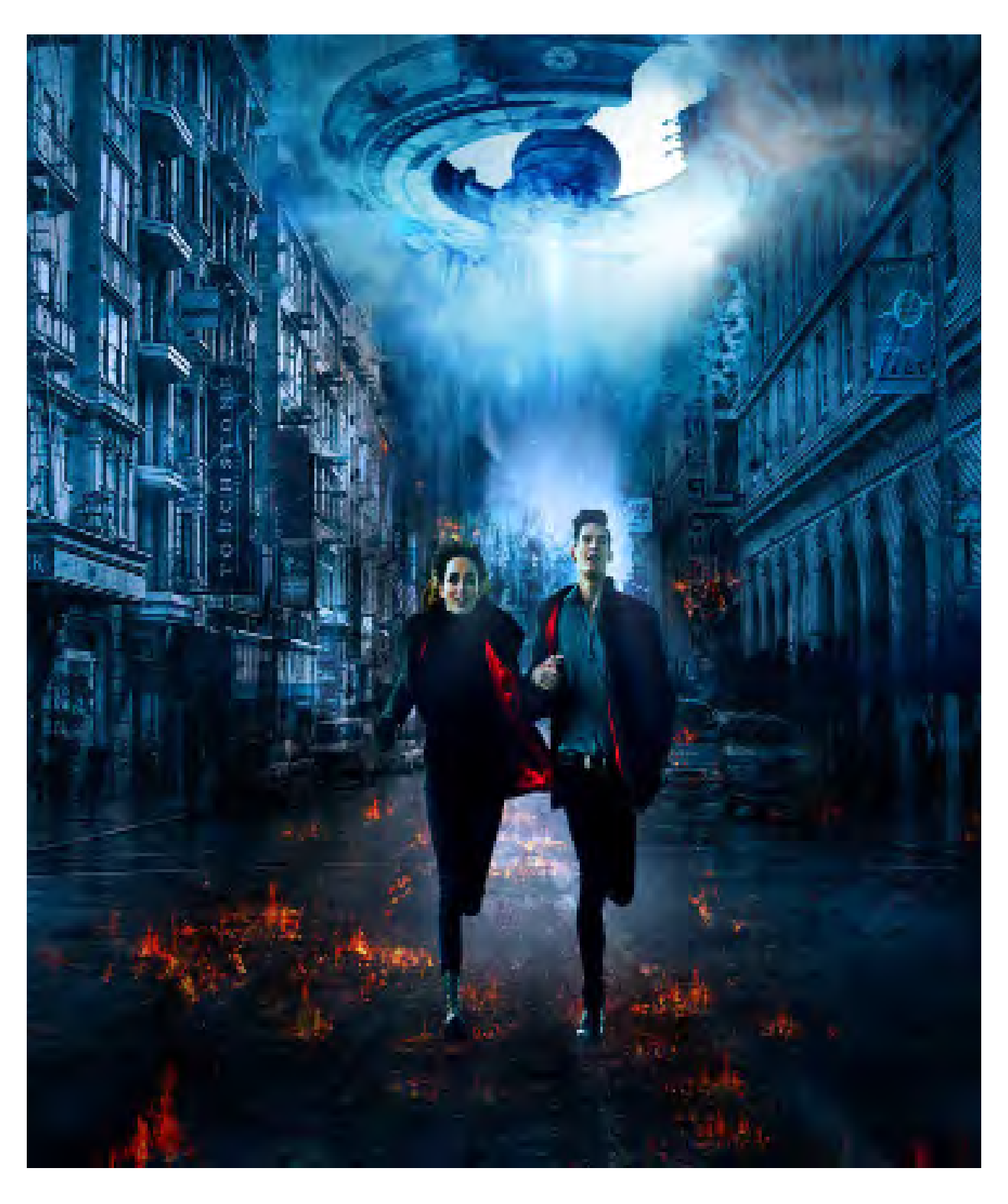
Annihilation of Humanity and Dangers of the Disclosure Movement

is why so much is at stake on whether the Disclosure Movement proceeds—it will potentially shift greatly, the energies to support the darkness and that is why it will be the undoing of humanity if the extraterrestrial menace cannot be explained to warn people what is truly at stake.