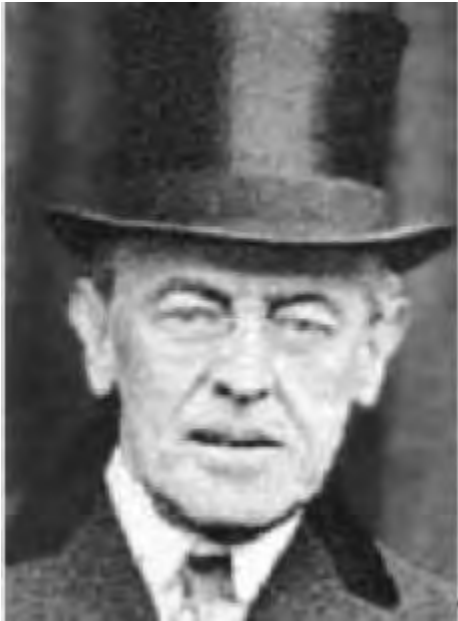
President Woodrow Wilson