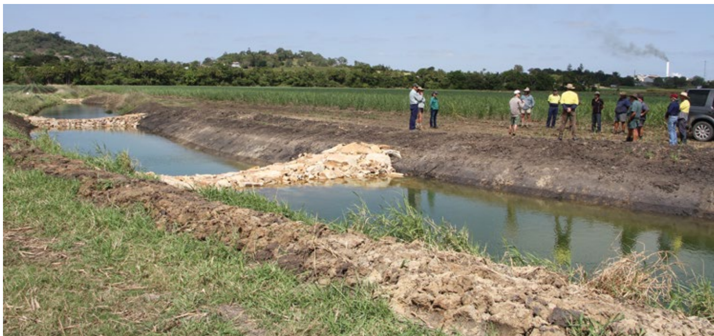
Peer to peer network members inspecting on-farm sediment basin at Jane Creek.