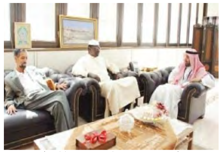
(Malik meets with WAMY in 2011)

Malik (Feb 16, 2011) as <u>reported</u> by Al-Riyadh Saudi news (see photo) meets with the World Assembly of Muslim Youth (WAMY):