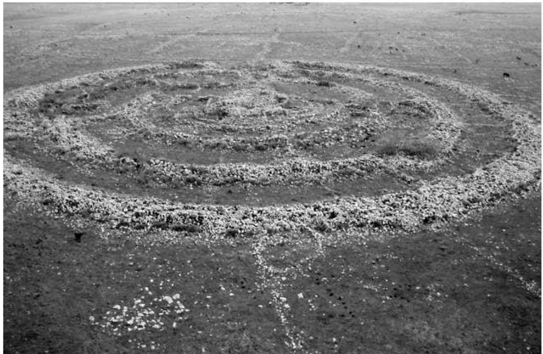
The megalithic “Wheel of Ghosts” (Gilgal Rephaim or ) on the Golan Heights dates back to 3000 to 2700 BC. The name of the site links ancient Rephaim giants to demons.