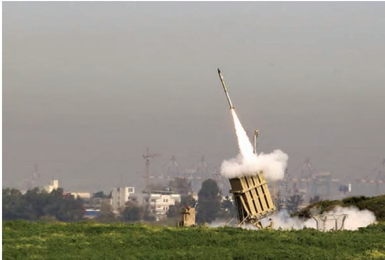
An Iron Dome, an Israeli automatic weapons defense system, fires a missile from the city of Ashdod in response to a rocket launch from the nearby Gaza Strip on March 11, 2012. The Iron Dome sends warnings of incoming threats to an operator who must decide almost instantly whether to give the command to fire.

80 percent success rate, “has shot down scores of missiles that would have killed Israeli civilians since it was fielded in April 2011.” 32 In a split second after detecting an incoming threat, the Iron Dome sends a recommended response to the threat to an operator. The operator must decide immediately whether or not to give the command to fire in order for the Iron Dome to be effective. 33