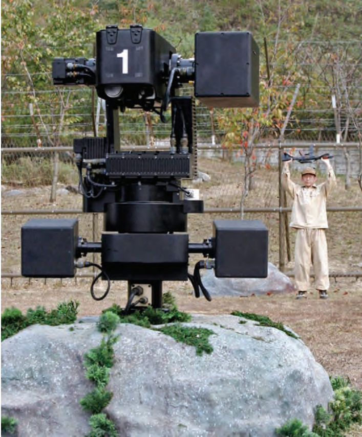
The South Korean SGR-1 sentry robot, a precursor to a fully autonomous weapon, can detect people in the Demilitarized Zone and, if a human grants the command, fire its weapons. The robot is shown here during a test with a surrendering enemy soldier.

Zone (DMZ) for testing in 2010. 42 These stationary robots can sense people in the DMZ with heat and motion sensors and send warnings back to a command center.