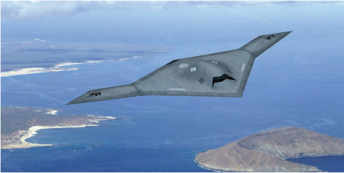
The US Navy's X-47B, currently undergoing testing, has been commissioned to fly with greater autonomy than existing drones. While the prototype will not carry weapons, it has two weapons bays that could make later models serve a combat function.

The United Kingdom unveiled a prototype of its Taranis combat aircraft in 2010. Designers described it as “an autonomous and stealthy unmanned aircraft” that aims to strike “targets with real precision at long range, even in another continent.” 61 Because Taranis is only a prototype, it is not armed, but it includes two weapons bays and could eventually carry bombs or missiles. 62 Similar to existing drones, Taranis would presumably be designed to launch attacks against persons as well as materiel. It would also be able to defend itself from enemy aircraft. 63 At this point, the Taranis is expected to retain a human in the loop. The UK Ministry of Defence stated, “Should such systems enter into service, they will at all times be under the control of highly trained military crews on the ground.” 64 Asked if the Taranis would one day choose its own targets, Royal Air Force Air Chief Marshal Simon Bryant