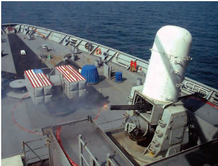
The US Navy's MK 15 Phalanx Close-In Weapons System is designed to identify and fire at incoming missiles or threatening aircraft. This automatic weapons defense system, shown during a live fire exercise, is one step on the road to full autonomy.

Automatic weapons defense systems represent one step on the road to autonomy. These systems are designed to sense an incoming munition, such as a missile or rocket, and to respond automatically to neutralize the threat. Human involvement, when it exists at all, is limited to accepting or overriding the computer's plan of action in a matter of seconds.