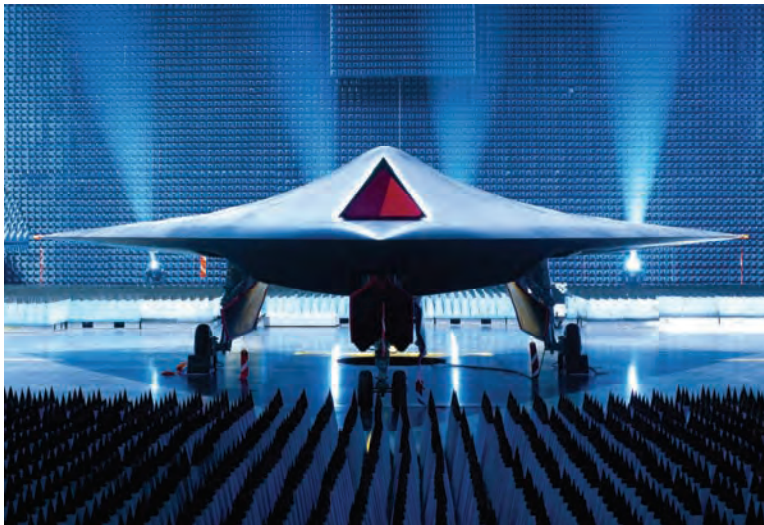
The United Kingdom's Taranis combat aircraft, whose prototype was unveiled in 2010, is designed to strike distant targets, “even in another continent.” While the Ministry of Defence has stated that humans will remain in the loop, the Taranis exemplifies the move toward increased autonomy.

responded, “This is a very sensitive area we are paying a lot of attention to.” 65 He thus left the door open to the possibility of greater autonomy in the future. 66