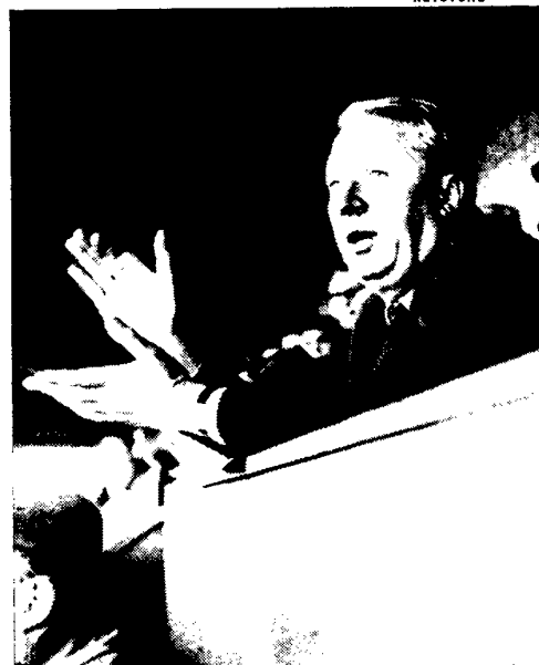
HEATH Full cry.

Of course, a landslide victory had also been forecast for Harold Wilson's Laborites 17 months ago. Instead, they barely broke 13 years of Tory rule, taking office with only a five-seat ma-