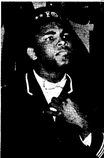
CASSIUS CLAY No battle at Verdun.

Even though he looks militant enough in the dress blues of the Fruit of Islam, the Black Muslims' Special Forces, Boxer Cassius Clay, 24, is a peaceful sort—as he loudly announced to the U.S. Selective Service when it reclassified him 1-A. "I don't have no quarrel with those Viet Congs," blared the Greatest. So the