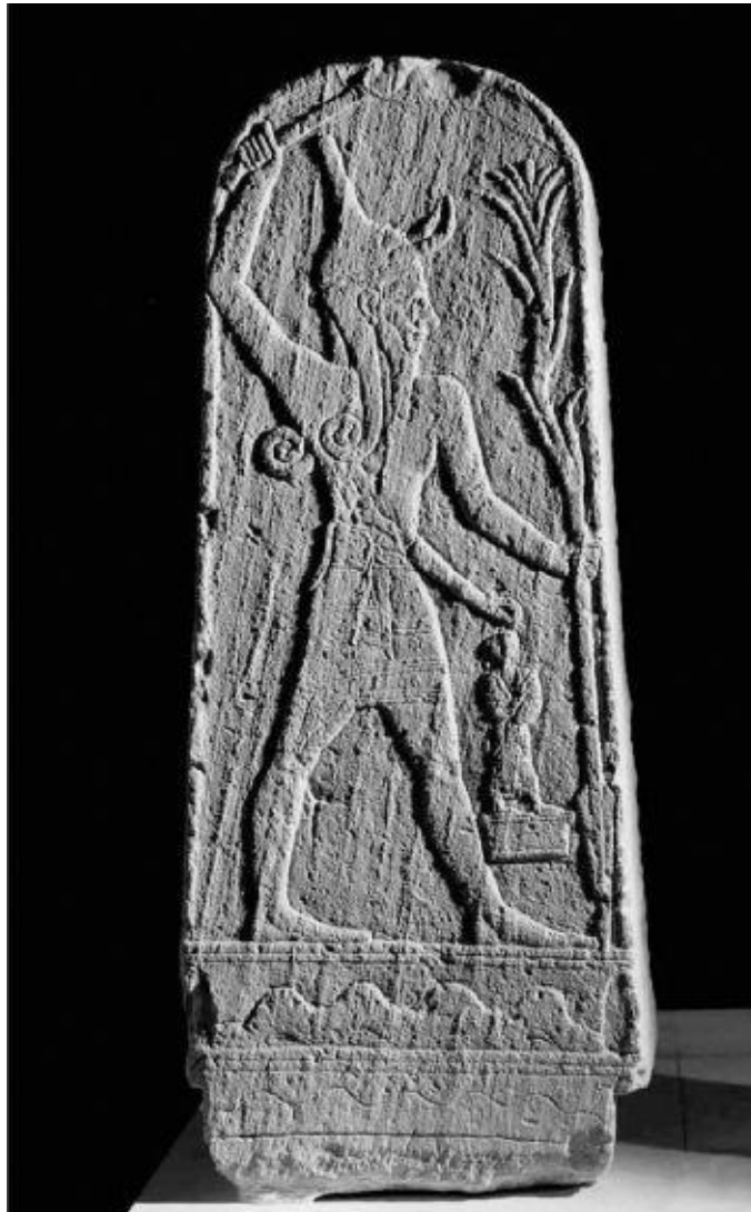
A limestone stela depicting the god Baal, about 4.5 feet (1.4 m) high and dating to the fifteen to the thirteenth century BCE. Baal is in a warlike posture, holding a club in his raised right hand and a downturned spear sprouting vegetation in his left. The smaller figure in the background, under Baal's dagger, may be the king.