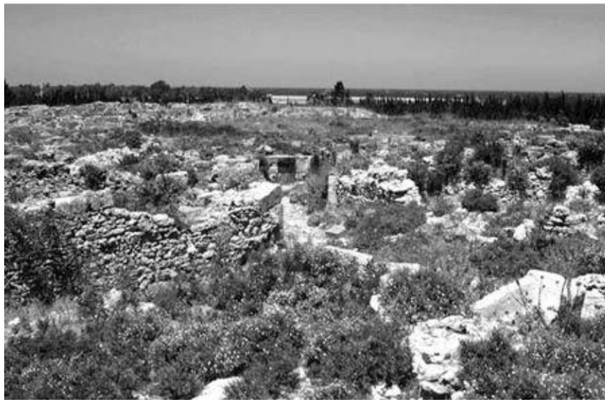
View of the ruins of the residential quarter of Ugarit, looking west toward the Mediterranean Sea

Ugarit, now called Ras Shamra (Cape Fennel), is located on the north Syrian coast of the Mediterranean and was one of the major Canaanite city-states during the second millennium BCE. The vaulted tombs and painted pottery of Ugarit’s cemetery initially led archaeologists to think that the city was a Mycenaean colony, but as the first texts were excavated, deciphered, and translated, it became clear that Ugarit was Semitic. There were Mycenaeans there, but they were only part of a polyglot and cosmopolitan port that included Hittites, Babylonians, Hurrians, and Egyptians, as well as the native Canaanites.