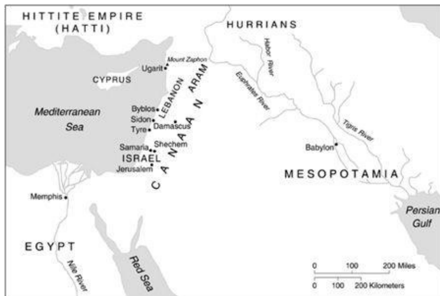
The Ancient Near East. (Map created by Blue Heron Bookcraft, Inc. Copyright © Michael D. Coogan.)

The term “Canaanite” requires explanation. The Canaanites were a group of Semitic peoples who during the third and second millennia BCE occupied parts of what is today Syria, Lebanon, Israel, Palestine, and Jordan. They were never organized into a single political unit; nevertheless, the relatively independent city-states such as Ugarit, Byblos, Sidon, Tyre, Shechem, and Jerusalem had a common language and culture (with local idiosyncrasies), which we call Canaanite. To give just one example, the same type of alphabetic cuneiform writing used in the texts translated here has turned up at several sites in Israel and Palestine. According to ancient Egyptian geography, Canaan’s northern border was just south of Ugarit, yet it is clear from innumerable religious and literary features that Ugarit had enormous cultural overlap with Canaanite society. With this in mind, we call its literature “stories from ancient Canaan.”