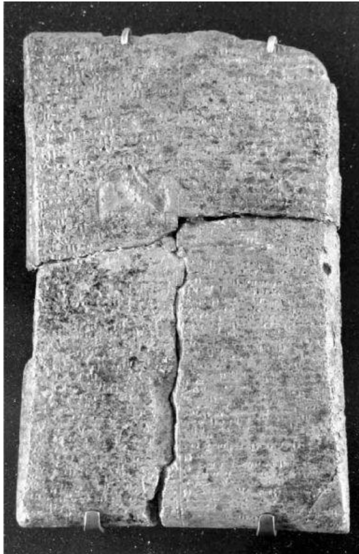
Reverse side of Tablet 3 of Aqhat (KTU 1.19); it is about 6.5 inches (17 cm) high. (Fouilles C. Schaeffer, 1931/Photographer: Rama. With permission. http://commons.wikimedia.org/wiki/File:Danel_epic_AO17323_img_0160.jpg .)