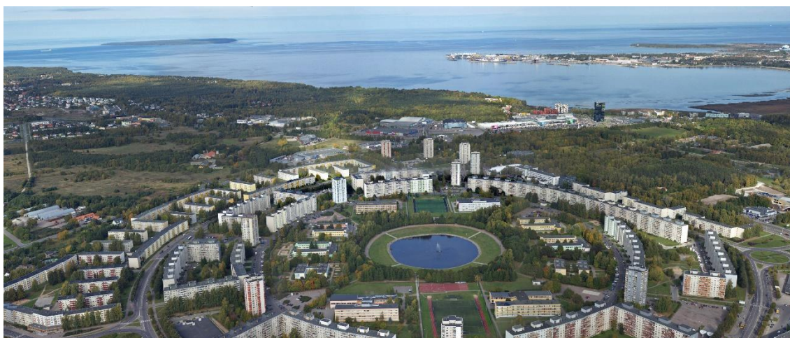
A view on the Õismäe City District

Plenty of visible developments can be seen elsewhere as well. For example, the student councils of district schools have started cooperating amongst themselves. Student councils typically only deal with topics concerning their own schools, but in this case, the project inspired the student councils to cooperate across boundaries. Student council representatives of Tallinna Ehte Gymnasium of Arts, Tallinna Mustamäe High School of Science and Tallinna Õismäe Russian Lyceum met in Autumn 2019 to get acquainted with each other and share Best Practices, to learn from one another and create something new together. As a result, they are leading way in organising a film festival of student productions with the URBACT project schools, scheduled for 2020. Hopefully, such cooperation will continue in the future.