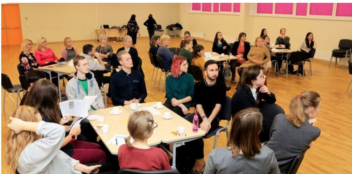
First meeting of Tallinn ULG stakeholders

One of Tallinn's first ON BOARD activities was forming the URBACT Local Group (ULG). More than twenty educational institutions wanted to participate, with several institutions noting in their applications that participating in the project would provide an opportunity to learn from the best practice of others and gain experience for social involvement and cooperation. Personnel development via international cooperation was also emphasised as a positive expected impact.