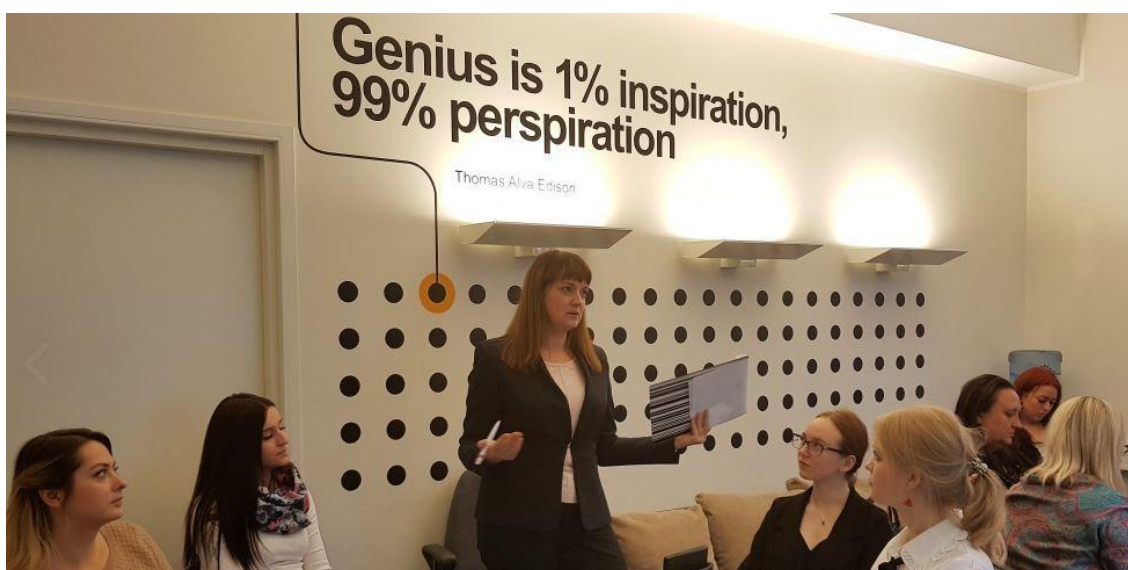
One of the work seminars of stakeholders in Tallinn Kopli Vocational School