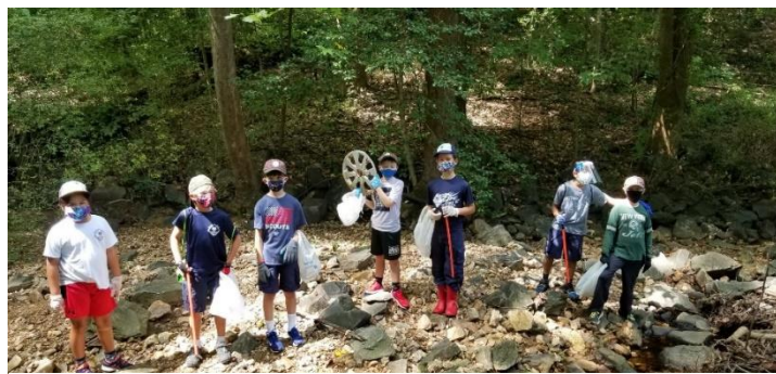
Conservation Good Turn Project