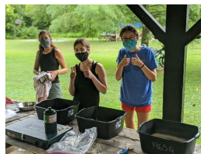
Troop 1965G Outdoor Scouting Fun at Brunswick Family Campground