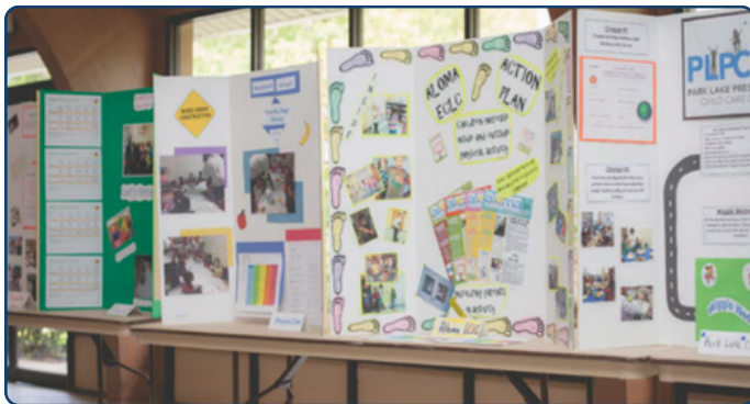
Example of Tri-fold Storyboards

GROWING SUNFLOWERS Sunflowers are an easy, fast-growing flower that can add much fun to the garden.