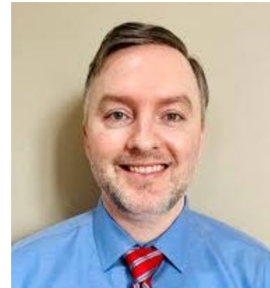
Jim Beasley Rhode Island Department of Health