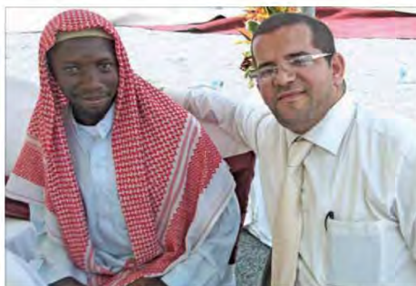
٤، وهو مدير مركز علم في مومباسا

والحداق لجذب الزائرين إلى المسجدة وساعات تعليم البن والبنات العالي ورصدت مبالغ طائلة للتصوير في أفريقيا بها باقى العلماء الإسلامي يتركز بمكانات ثنية محدودة تعتمد على تبرعات المغر الدعين.