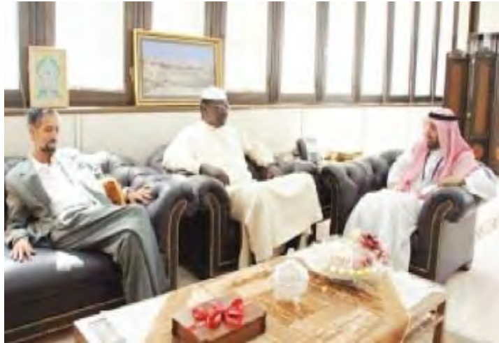
(Malik meets with WAMY in 2011)

Malik (Feb 16, 2011) as reported by Al-Riyadh Saudi news (see photo) meets with the World Assembly of Muslim Youth (WAMY):