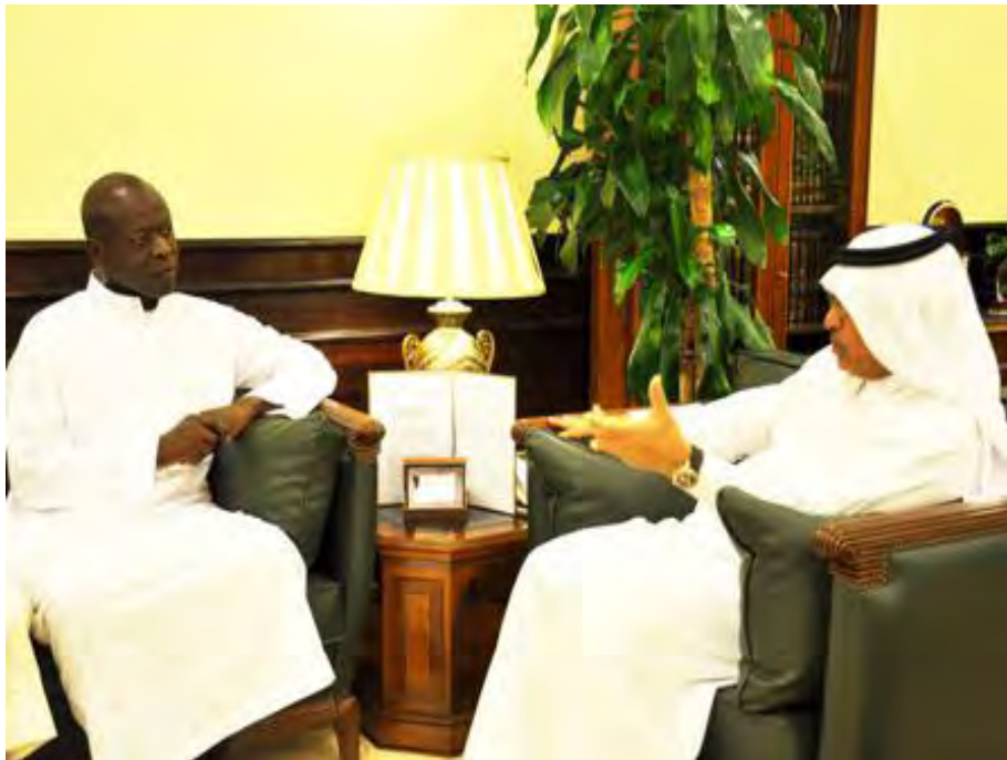
(On left - Sayid Obama)