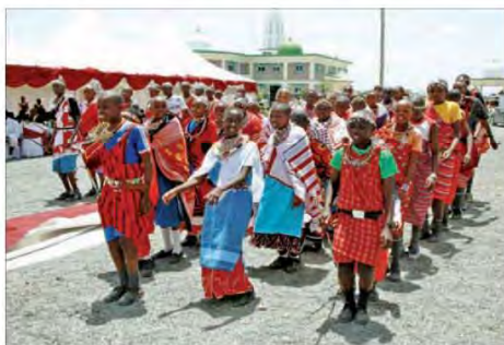
٤ من العلماء الكينيين