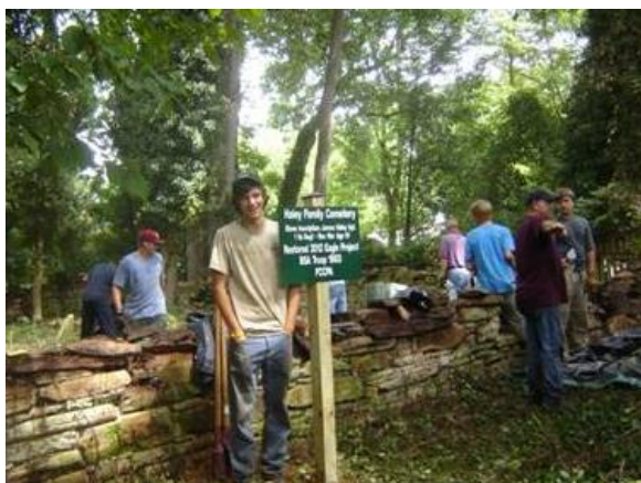
Scouts Working at the Cemetery in 2012