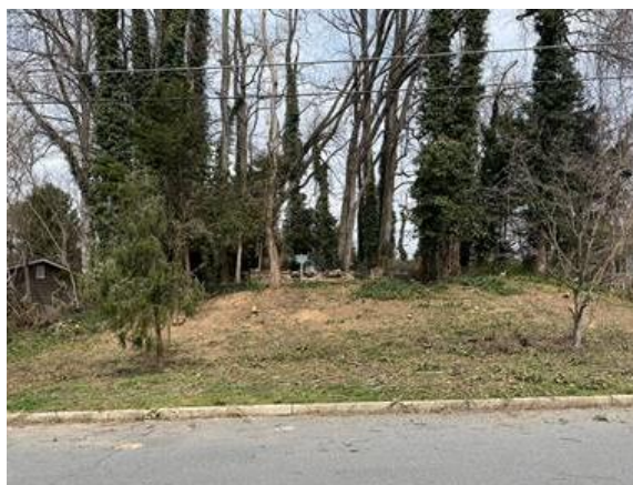
Historic Cemetery in Fairfax