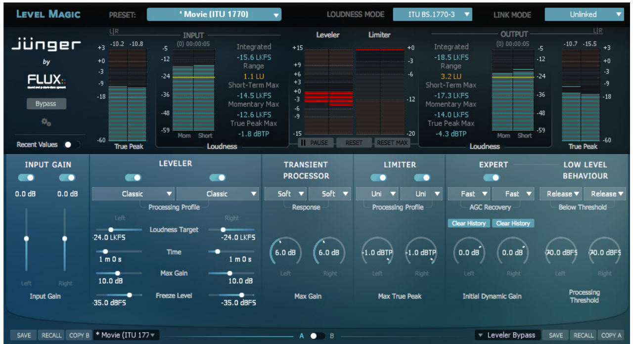
Stereo Mode - Unlinked