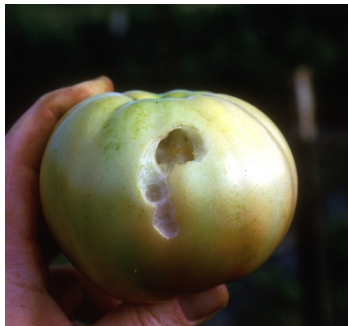
Hornworm damage on tomato

Hornworm damage usually begins to occur in midsummer and continues throughout the remainder of the growing season. The size of these garden pests allows them to quickly defoliate tomatoes, potatoes, eggplants, and peppers. Occasionally, they may also feed on green fruit. Gardeners are likely to spot the large areas of damage at the top of a plant before they see the culprit.