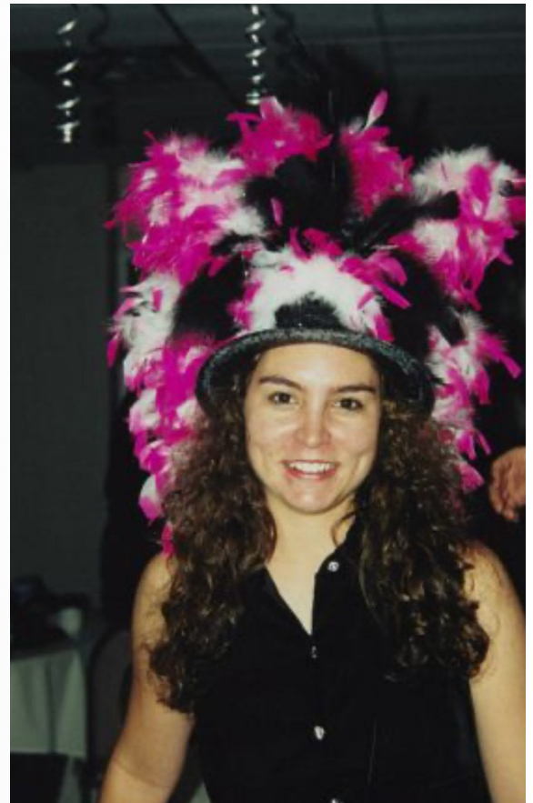
ASLA Nevada Chapter UNLV Special Collections and Archives Photo Credit, Tammi Gaudet